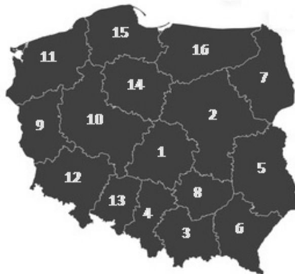
Figure 1. Voivodeships (NUTS-2 mesoregions) in Poland as of 2016

However, the situation of Polish mesoregions remains diversified in terms of projected demographic trends on population ageing and population decline, what pictures their various socio-economic position and historical background. Figure 1 depicts the territorial location of 16 Polish voivodeships which represent the EU NUTS-2 mesoregions and Table 1 presents the Polish and English equivalents of their names together with some basic information on a given voivodeship.