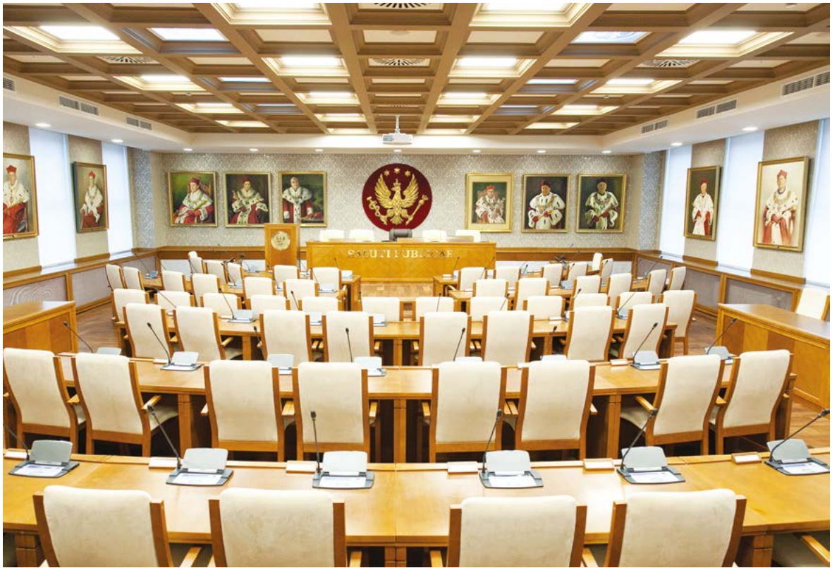
5. Gallery of Portraits of Vice-Chancellors in the Senate Hall, Medical University of Warsaw, to be included in the inventory of the Medical History Museum