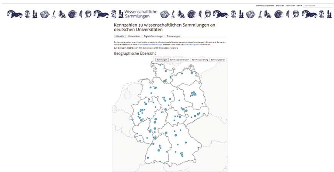
1. Page view of the website https://portal.wissenschaftliche-sammlungen.de/kennzahlen showing the map of German university collections