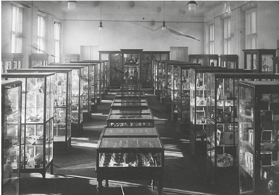
4. Edward Loth Museum of Descriptive Anatomy, interwar period, collections of the National Digital Archive

the collections of the Medical University of Warsaw (WUM), we come across merely two such items, i.e. the Museum of Medicine History placed within WUM premises and the Department of Dental Propaedeutics and Prophylaxis. Is it really possible that at the Medical University in Warsaw there are only two collections that can be considered of museum character? Before the answer to this question is given, it would be advisable to present a historical background to medical, academic collectorship in Warsaw.