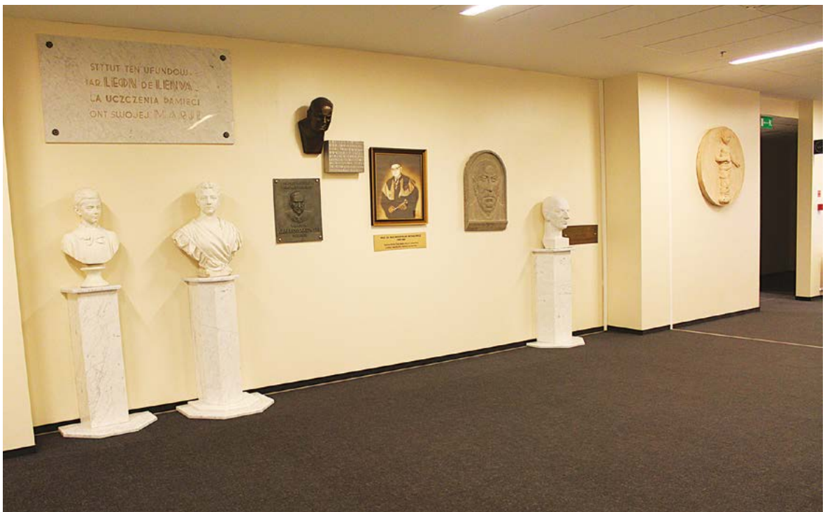
6. Display space at J.P. Brudziński Paediatric Hospital in Warsaw