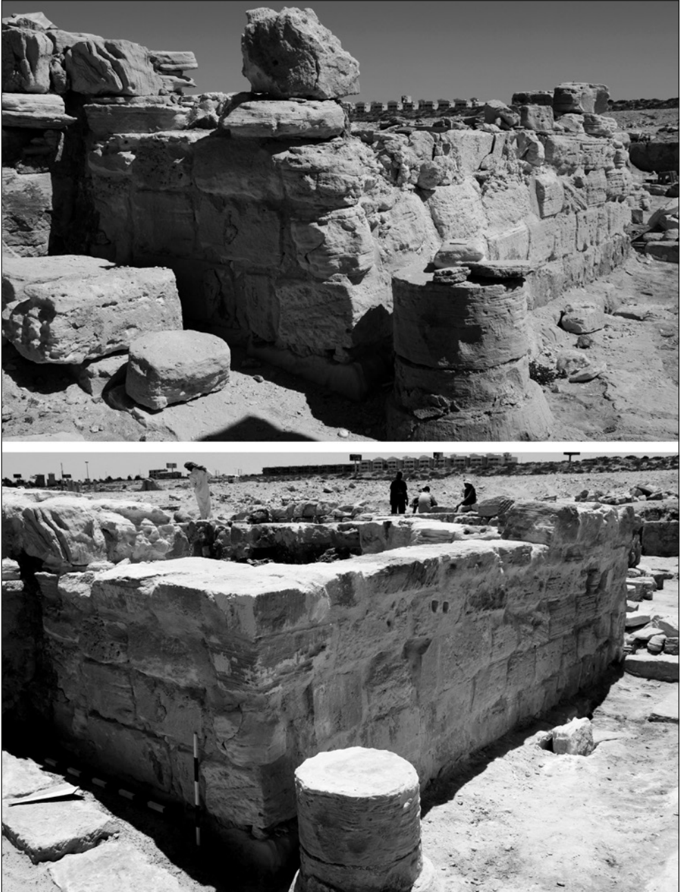
Fig. 1. Bath courtyard (room 4): external walls of room 7 before (top) and after (bottom) conservation in 2012