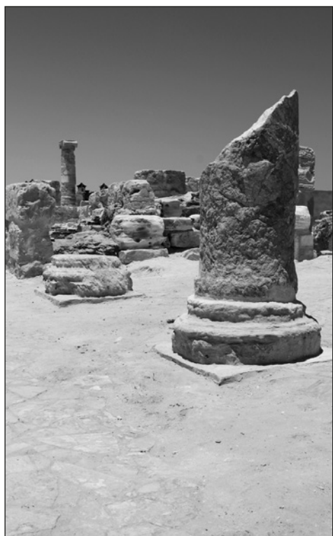
Fig. 4. Baths, room 8a–8b: marble columns after partial anastylosis and conservation in 2012

Protective bands were put around the relics of plaster on the full length of the east wall and the lower part of the west wall excavated this season (8b). Mineral mortar with sand filler as above was used. Repairs were made to the damaged parts of bands put in the previous seasons around plaster surviving on the north and west walls of room 8a. In the lowest part of the west wall in room 8a, two sockets were cut to fit patches the size of the whole surface of the highly weathered blocks. Patches were prepared and set with the use of mineral mortar.