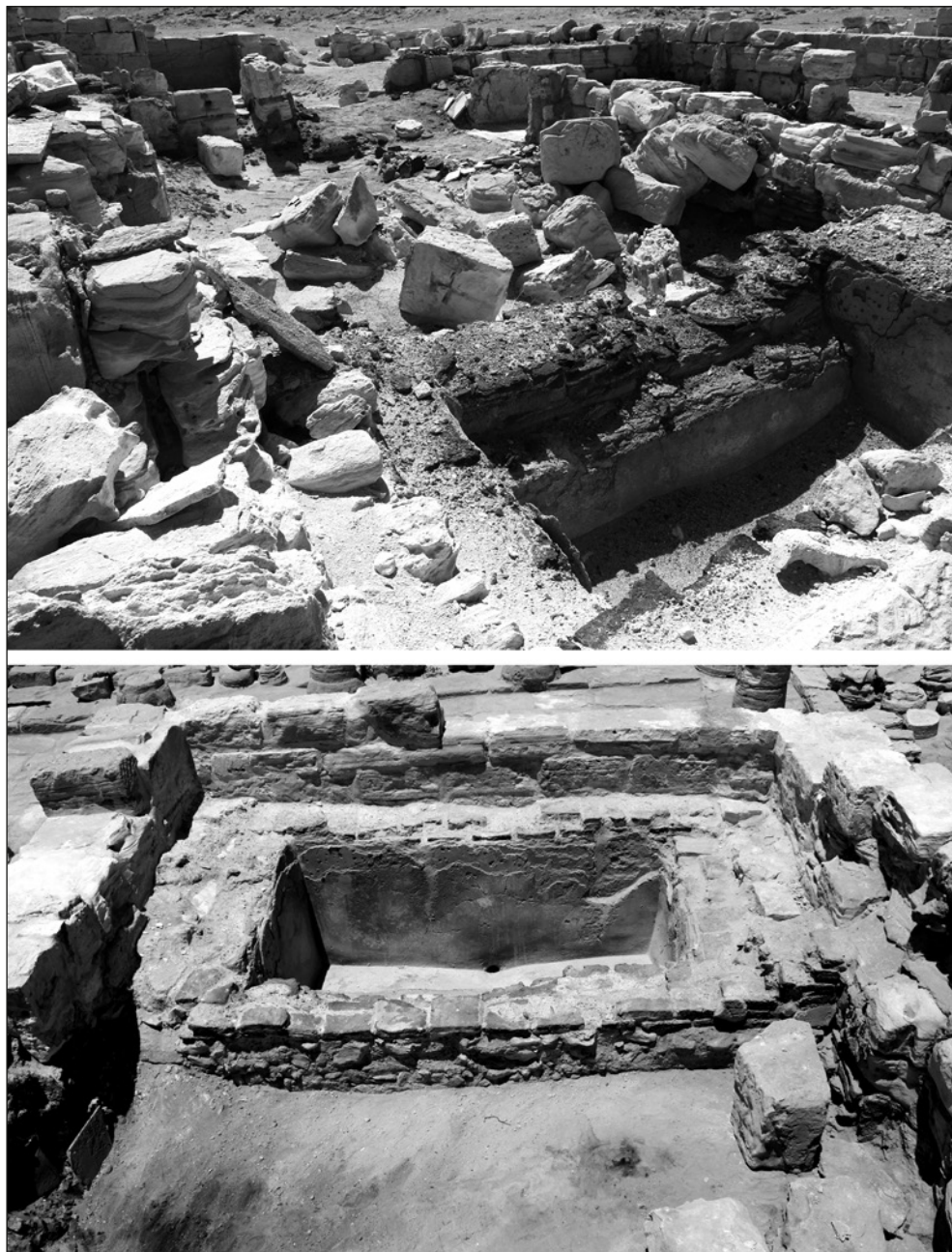
Fig. 2. Baths, alveus 7a before (top) and after (bottom) conservation in 2012