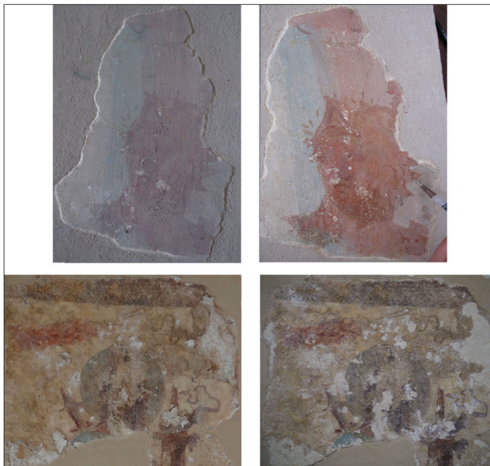
Fig. 6A. Wall painting fragments, before (left) and during (right) salvage conservation in 2013: top, portrait of a queen in nautical crown; bottom, depiction of Heron

Standard documentation of the state of preservation of the wall painting was carried out first. Loose deposits were