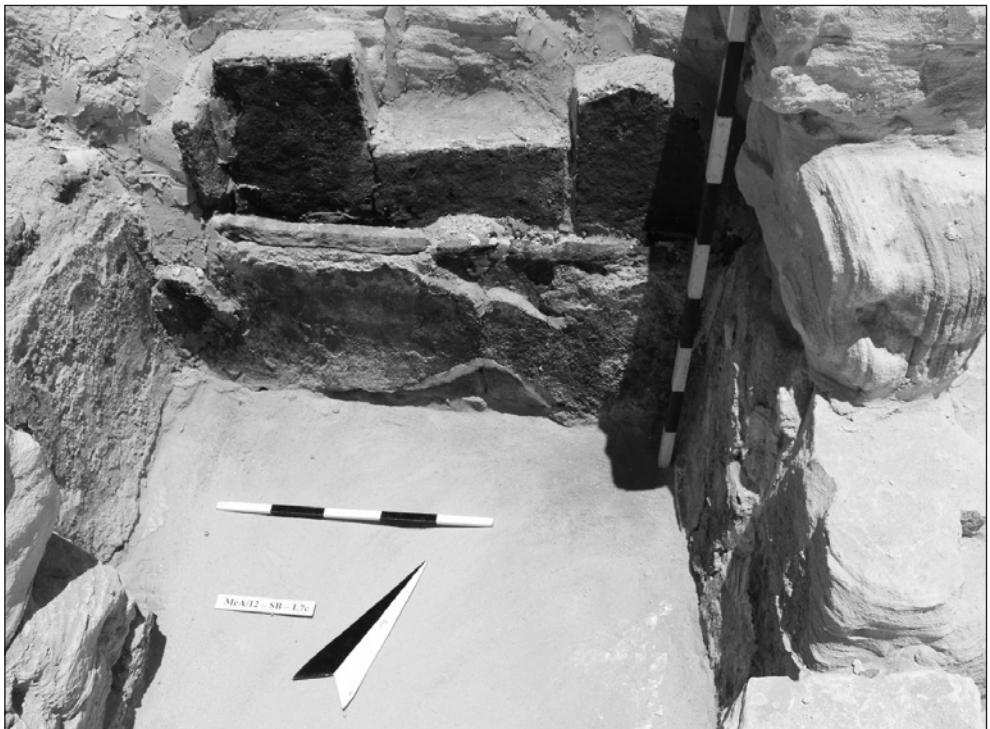
Fig. 5. Baths, room 7c: element of the heating system after conservation in 2012