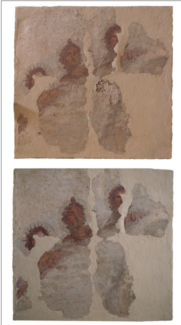
Fig. 6B. Wall painting fragments with representations of Helios, Harpokrates and Serapis before (top) and after (bottom) salvage conservation in 2013