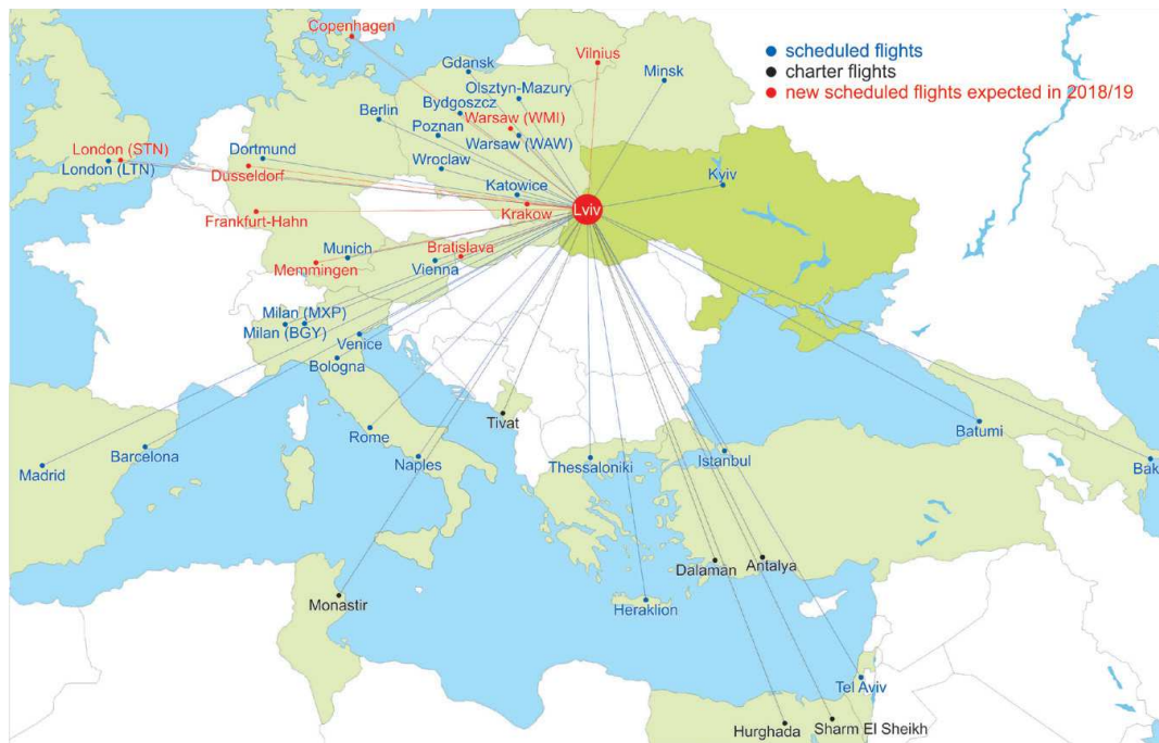
Figure 1. Direct international regular flights from Lviv airport