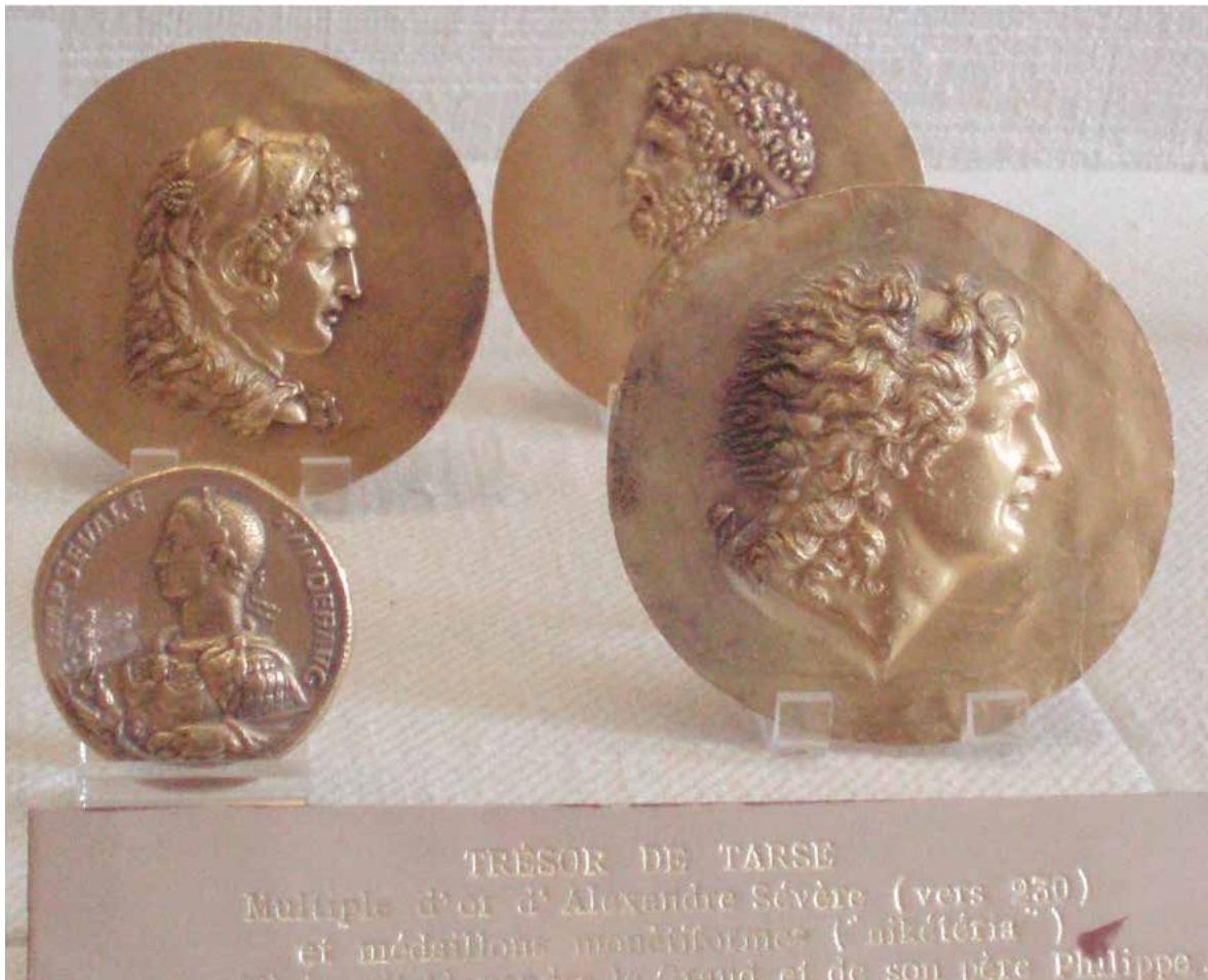
5. Paris, Bibliothèque Nationale de France, Cabinet des Monnaies, Médailles et Antiques, 4 golden Olympic medals, 3 rd c. AD; photo 2007