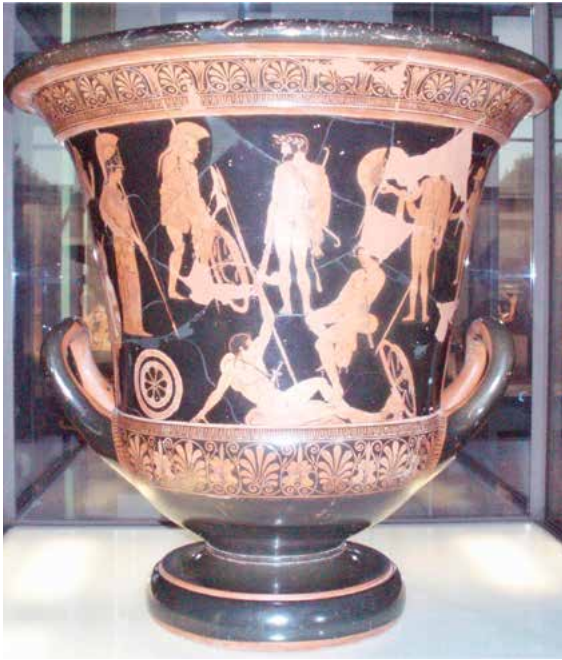
10. Paris, Louvre Museum, Niobid Krater (480–460 BC); photo 2007