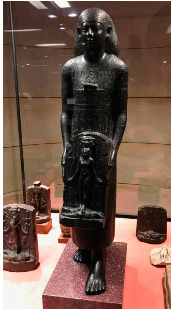
4. Paris, Louvre Museum, Tyszkiewicz Statue , black basalt, 4 th c. BC (ACNO E10777); photo 2018

dignitaries. 7 The Tyszkiewicz's motto read: Pandite lucem in asperis vitae (Cabinet of Polish Medals) . 8 It was implemented in numerous ways, also in the arena of collectorship. Michał Tyszkiewicz's merits were substantial already in the Vilnius period. When in 1855 his cousin Eustachy Tyszkiewicz (1814–73) was setting up the Museum of Antiquities in Vilnius, Michał was one of the first to support this project by commissioning museum furniture: coin display tables and cabinets. 9 In 1856, he was nominated regular member of the Vilnius Archaeological Committee, while in 1858 he became member of the Archaeological Committee founded in Sankt Petersburg by Tsar Alexander II.