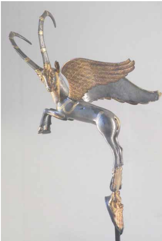
11. Paris, Louvre Museum, Winged Billy Goat , partially gilded silver, 4 th c. BC; the goat's rear hoofs are resting on the Silen's mask; photo 2019