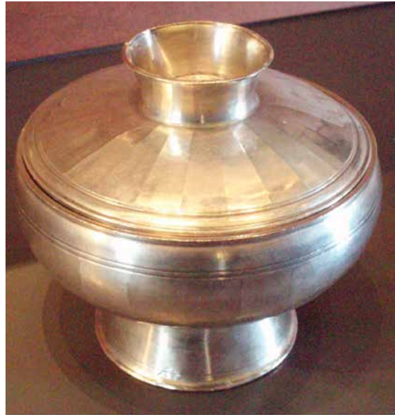
12. Paris, Louvre Museum, Le Trésor de Carthage, silver lidded goblet, 4–5 th c. AD; photo 2007

Moreover, Tyszkiewicz was interested in ancient jewellery and silver. In 1897, his collection boasted 49 golden jewels, including a golden diadem from the 3 rd century BC (250–200) which, according to the register of 2 July 1898, was purchased by the British Museum for 6.100 francs. The Tyszkiewicz Collection also contained a masterpiece of Oriental art from the 4 th century BC, namely a sizeable (27 cm) Winged Ibe gilded silver, serving as an amphora handle found in the Palace of Darius I in Susa. In 1898, the Louvre paid for it 29,600 francs (Accession No. AO 2748). Furthermore, the Museum paid 1.590 francs for 4 silver vessels: a goblet with a handle, large lidded goblet, and two deep spoons from the Carthage Treasure. 66 This type of Christian silver vessels (most likely liturgical) was popular in Roman Africa between the 4 th quarter of the 4 th century and the 1 st quarter of the 5 th century. 67 Until 1876, the objects were the property of Charles A. Tulin (1837–99), Consul General of Sweden in Tunis. The set of silverware purchased from Tyszkiewicz by the Louvre is completed with a silver mirror with a handle in