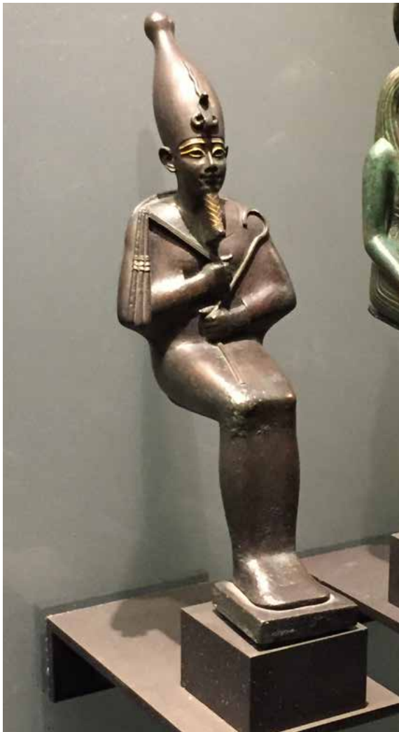
3. Paris, Louvre Museum, Seated Osiris , Late Period (664–332 BC), gold-encrusted bronze, Tyszkiewicz's donation, (ACNO E 3751); photo 2018