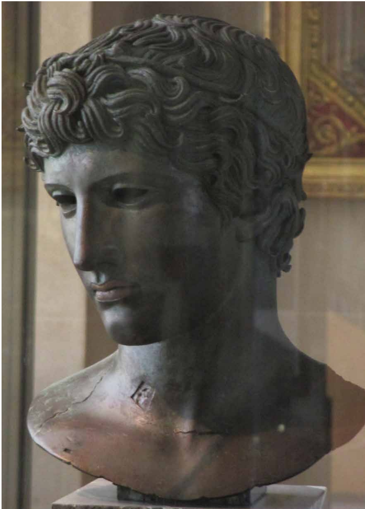
6. Paris, Louvre Museum, Head of the Athlete of Benevento , bronze, 1 st c. BC – 1 st c. AD; photo 2019