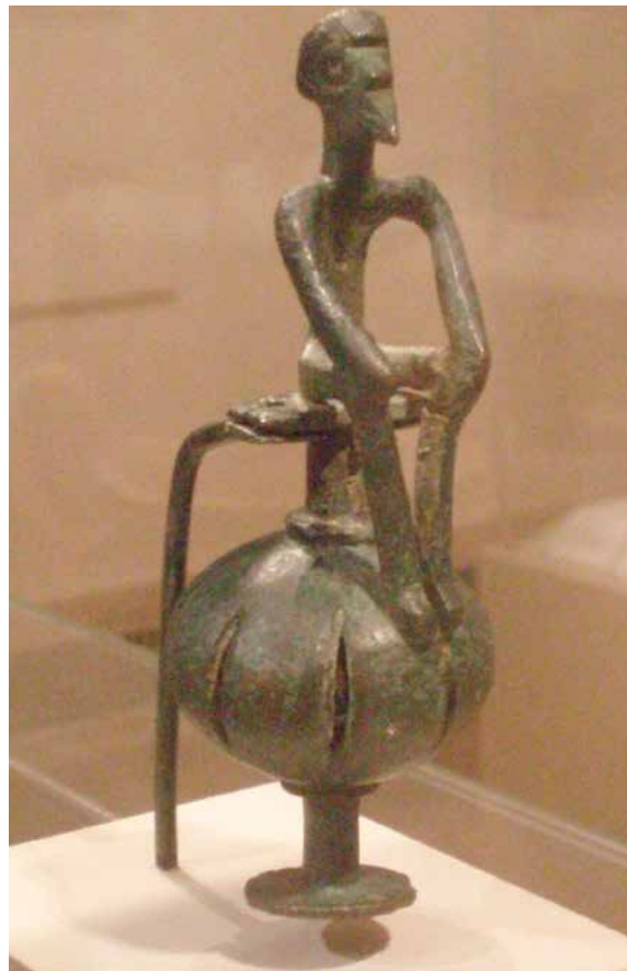
13. New York, Metropolitan Museum of Art, archaic bronze (720–680 BC); photo 2013