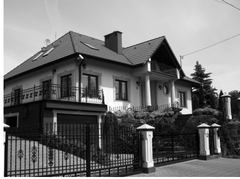
Będzin—palace of affluence

result in resting on their laurels or becoming unproductive or impotent but becomes another starting point to face new challenges.