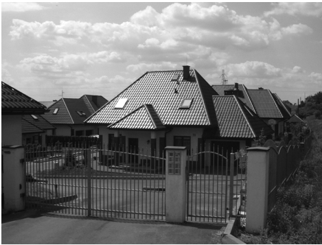
Green Valley—Ghetto of affluence in Sosnowiec

Ghettos of affluence are an essence of al. systems—urban, architectonic, functional, aesthetic, ecological and social.