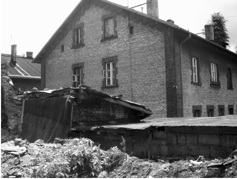
Walls of the Ghetto in Czeladź