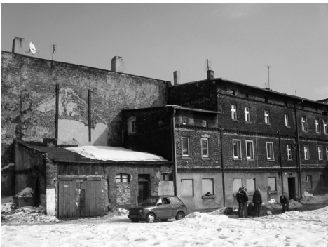
“Hollow People” Lipiny in Świętochłowice

Disintegration of family structure, isolation from the affairs shared by the society at large, functioning on the border of the law, a specific rhythm of life consisting in improvised existence — those are characteristic structural features of poverty ghettos.