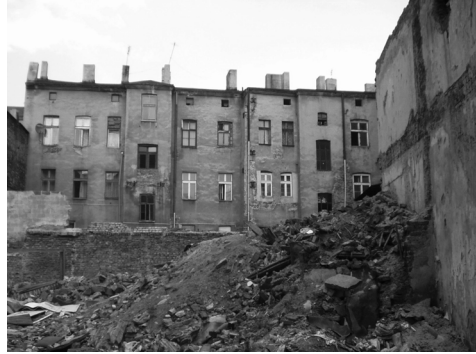
Cemetery of life sense... Sosnowiec