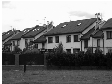
Street of happiness in Czeladź

Well ordered planned districts of colourful houses make an impression as if made of children's bricks. Frequently with internal streets called with the names of fairy tale heroes or names from TV or film productions. So there are sesame, rainbow, flower, bird developments, green valleys, eldorados, arcades—artificial worlds associating with imagined lands of fairylands.