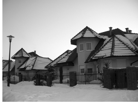
District Z1. Ghetto of affluence in Tychy

Such a catalogue of variables, qualifies a given area as a poverty pocket and enclave, made it possible to describe the Silesian ghettos, inhabited by the underclass.