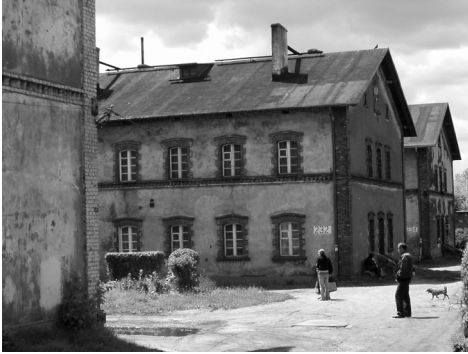
Ghetto of Poverty in Czeladź