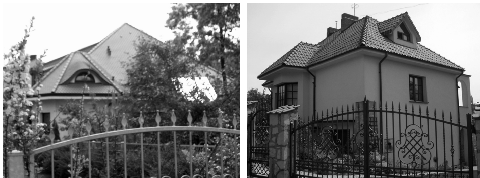
Gates to the Ghetto of affluence in Katowice

symbolically marked with two extremes; coal-based economy and knowledge-based economy, from production to consumption; a change that generated new social space in the metropolis of the Katowice conurbation—spaces of poverty and riches, ghettos of poverty and ghettos of affluence, Barren Land and Legolands. A change that created new spatial and social borders, determined by the volume of possession as well as emotions felt by everybody for whom the city is the fundamental space of wandering.