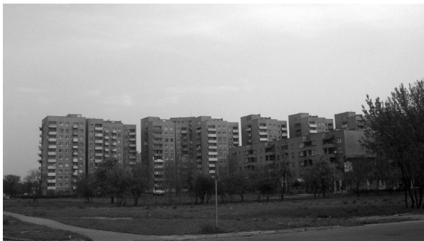
LeCorbusier's Ghetto in Dąbrowa Górnicza

socialism as sleeping quarters for the working people, who had come to Indunature as to a promised land. It was very heterogeneous people, from different kinds countries, different places with low level of culture capital. The construction of identical worker's houses or the later prefabricated elements" stems from the commonly known Athens Card.