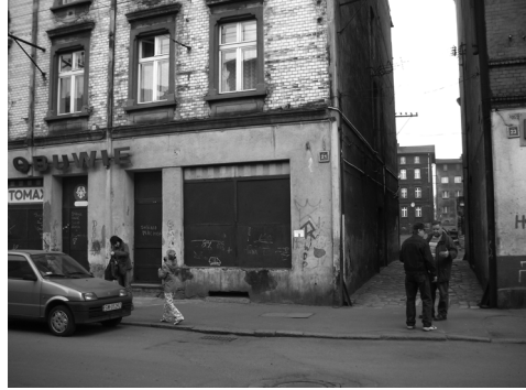
People without properties... Świętochłowice-Lipiny