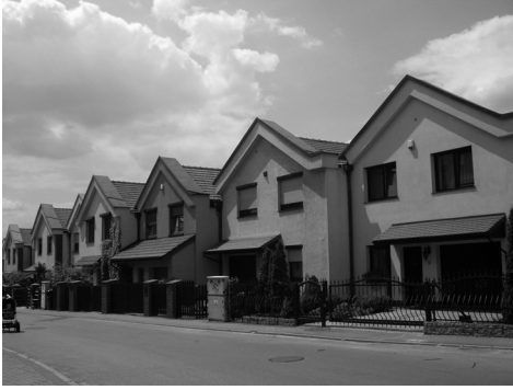
Brynów. Legoland in Katowice