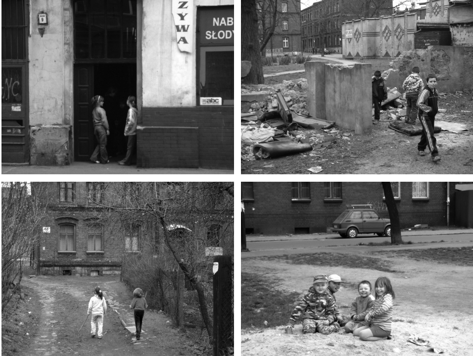
Children of the ghettos of poverty in Silesia region

aggression, and low intellectual opportunities. They duplicate their parents' lifestyle, becoming a social margin. Lack of proper patterns in the family makes it impossible for them to create close and fruitful relations with their contemporaries. Blocks of flats in towns remain difficult to be analysed precisely. Still, a large number of unemployed live there—people who lost their jobs as a result of industry restructurization.