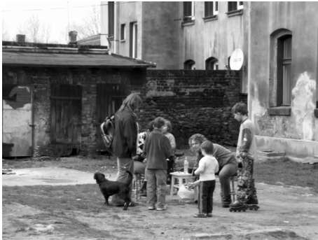
Inhabitants in the ghetto of poverty in Ruda Śląska