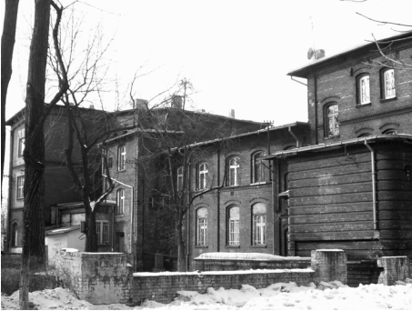
Bobrek. Ghetto of poverty in Bytom