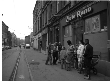
Inhabitants of the ghetto of poverty in Świętochłowice—Lipiny

A striking feature of the extreme poverty is a high percentage of young people with many children, low level of education, low qualifications, and some degree of functional analphabetism. In the light of the research carried out every year in Poland by the Chief