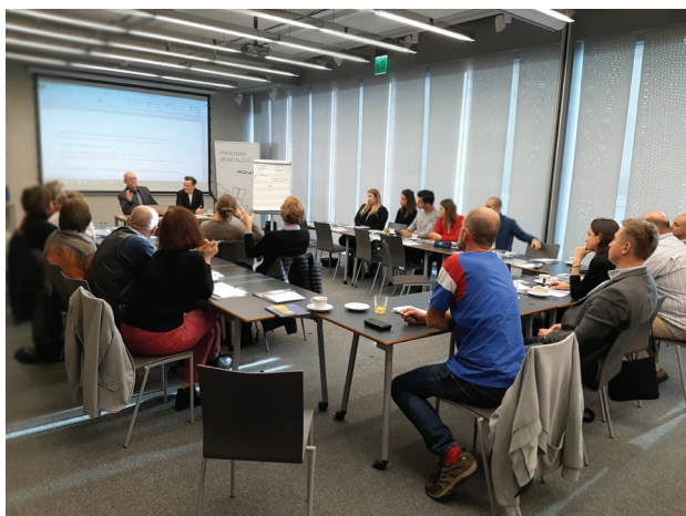
Fig. 2. Participants of the workshop – representatives of local entrepreneurs, housing estate board and local activists

Il. 2. Uczestnicy warsztatów – przedstawiciele lokalnych przedsiębiorców, rady osiedla i lokalnych aktywistów