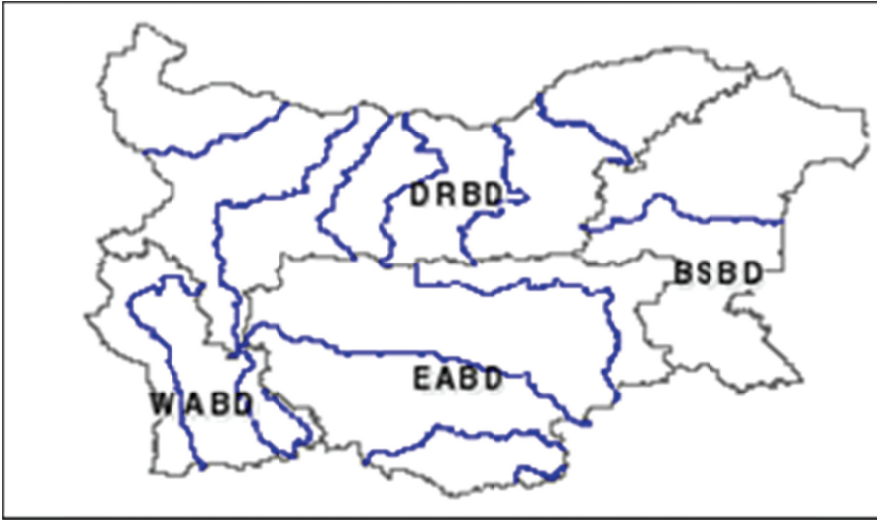
Fig. 2. Territory of the basin directorates.