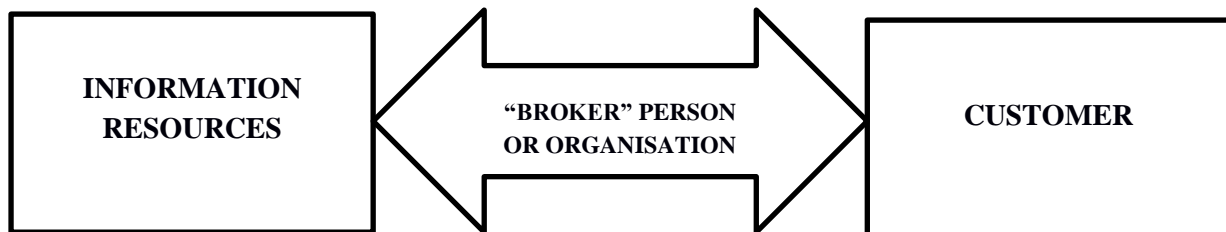
Figure no. 3 Key elements of infobrokering