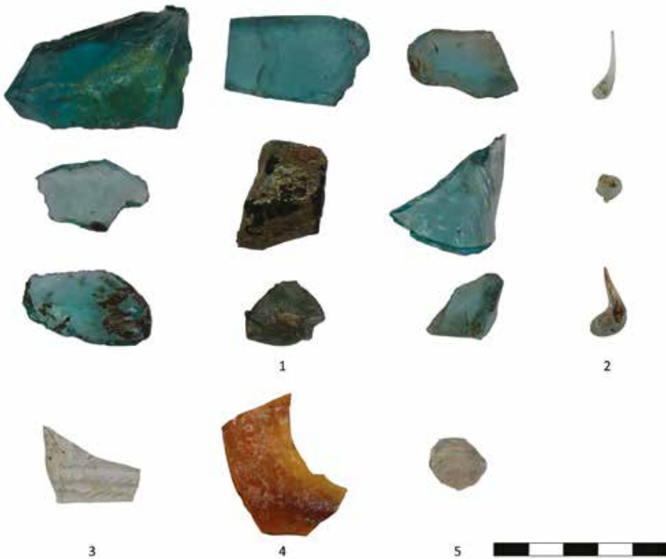
Pl. 5/2: Selection of glass finds. 1: pieces of raw glass; 2: example of the production indicators - drops; 3: fragment with deep cut geometrical decoration in wide lines; 4: the amber coloured fragment; glass fragment secondarily worked into a token.