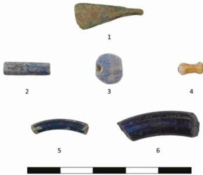
Pl. 5/1: Selection of small finds. 1: bronze axe head pendant; 2-4: Glass beads with the first two representing the most common types found at Yurta-Stroyno; 5-6: fragments of glass bracelets (10 th -12 th c. AD).