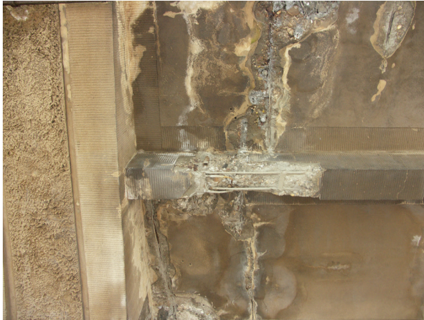
Fig. 8. Former St. Jobsveem warehouse.

The underside of the concrete platforms before restoration. The plaster finish of the tapered bracket (bottom) combines a spatter dashed field with a combed trim. The surface textures of the ceilings show severe damage and colour variation. The reinforcement steel of the secondary beam appeared severely corroded