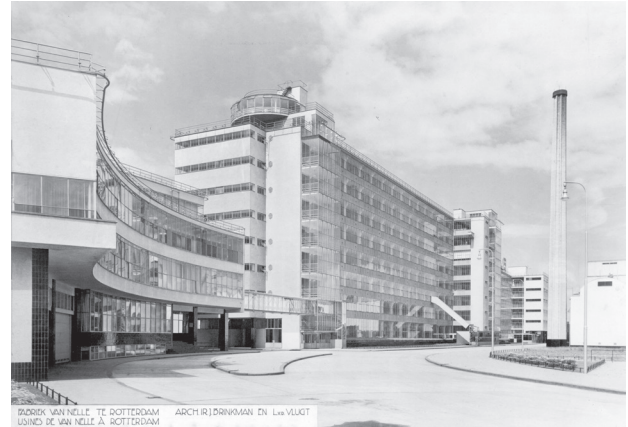
Fig. 3. The Van Nelle Factory in 1930.

The obstruction of daylight by the floor beams was regarded as a disadvantage of this system, and contrasted with the principles of the Modern Movement. For the daylight factory for the Van Nelle company in Rotterdam, designed between 1925–1931 by the architects Jan Brinkman (1902–1949) and Leendert van der Vlugt (1894–1936), Wiebenga therefore proposed a reinforced concrete frame with smooth floor slabs on octagonal mushroom columns – almost