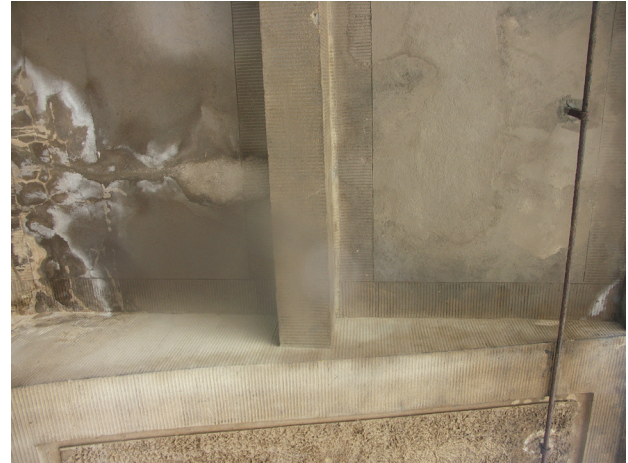
Fig. 9. Former St. Jobsveem warehouse.

Dwie faktury tynku wspornika (dolnego) – nakrapiany i czesany. Powierzchnie sufitu wykazują poważne uszkodzenia i różnice kolorystyczne. Stal zbrojeniowa belki wydawała się poważnie skorodowana