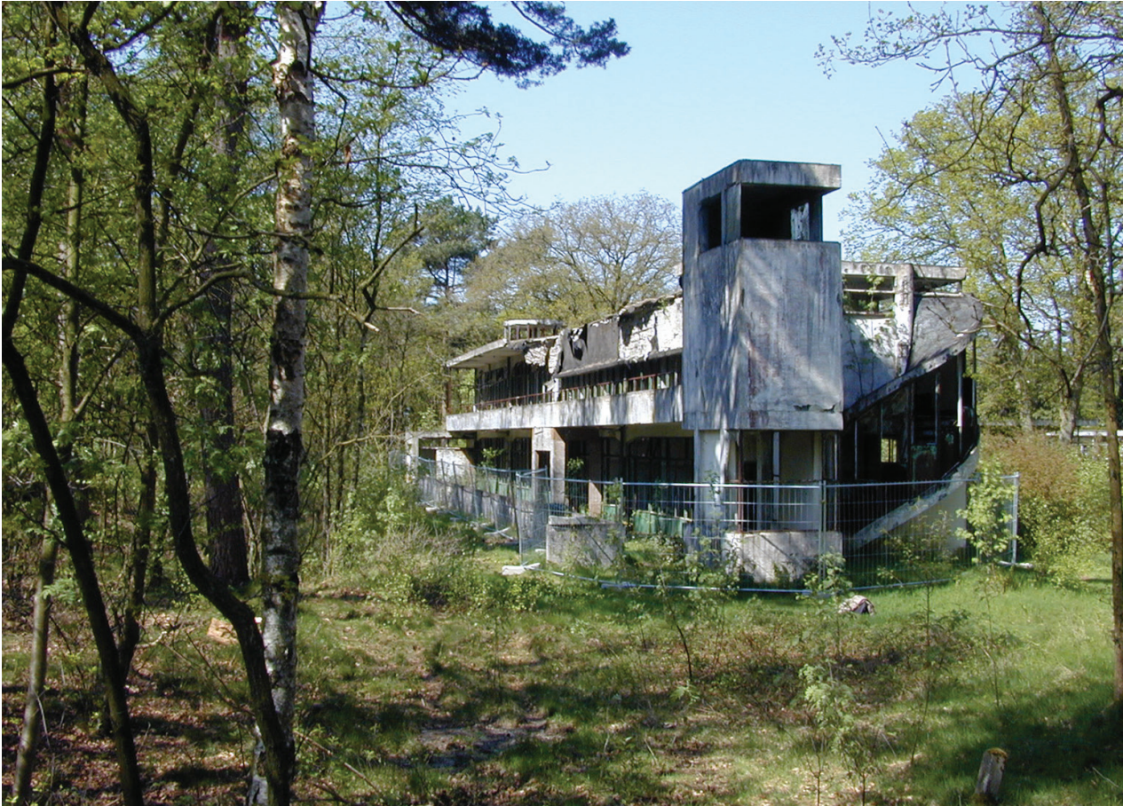
Fig. 11. „Zonnestraal”, Dresselhuys Pavilion (1931) after the collapse of the chloride-infused reinforced concrete roof slab. The exterior restoration of this structure was completed in 2013

Il. 11. „Zonnestraal”, Pawilon Dresselhuys (1931) po zawaleniu się żelbetowej płyty dachowej poddanej procesowi korozji chlorkowej. Renowację budynku od zewnątrz zakończono w 2013 r.