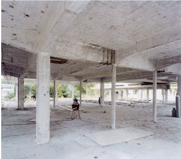
Fig. 2. "Zonnestraal" sanatorium, main building (1928), ground floor during the restoration works.

The render and plaster finishes have been blasted off revealing the slenderness of the actual reinforced concrete structure. The metal brackets involve a repair that dates to the time of construction (photo: © WDJArchitecten, around 2002)