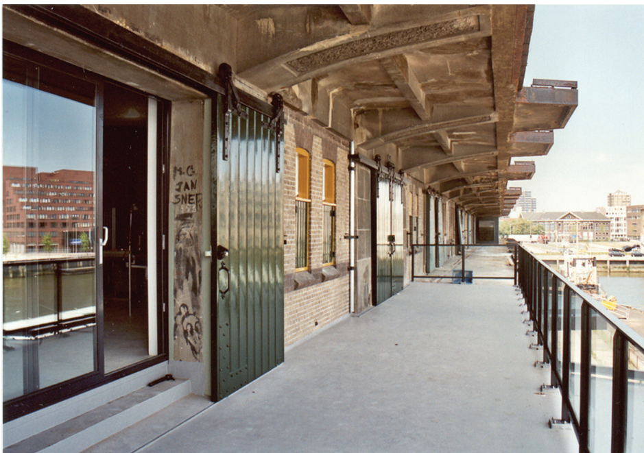
Fig. 7. Former St. Jobsveem warehouse. The installment of a model apartment included trial repairs of the concrete decks that were to serve as terraces. The underside of the platform above still shows the damage to the plaster finish that was originally dressed to mimic natural stone