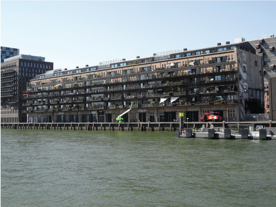
Fig. 6. The St. Jobsveem warehouse (1914) in the Rotterdam docklands after conversion into a condominium with 109 apartments in 2007. Due to the ample loadbearing capacity of the huge reinforced concrete loading platforms these could be transformed into hanging gardens.