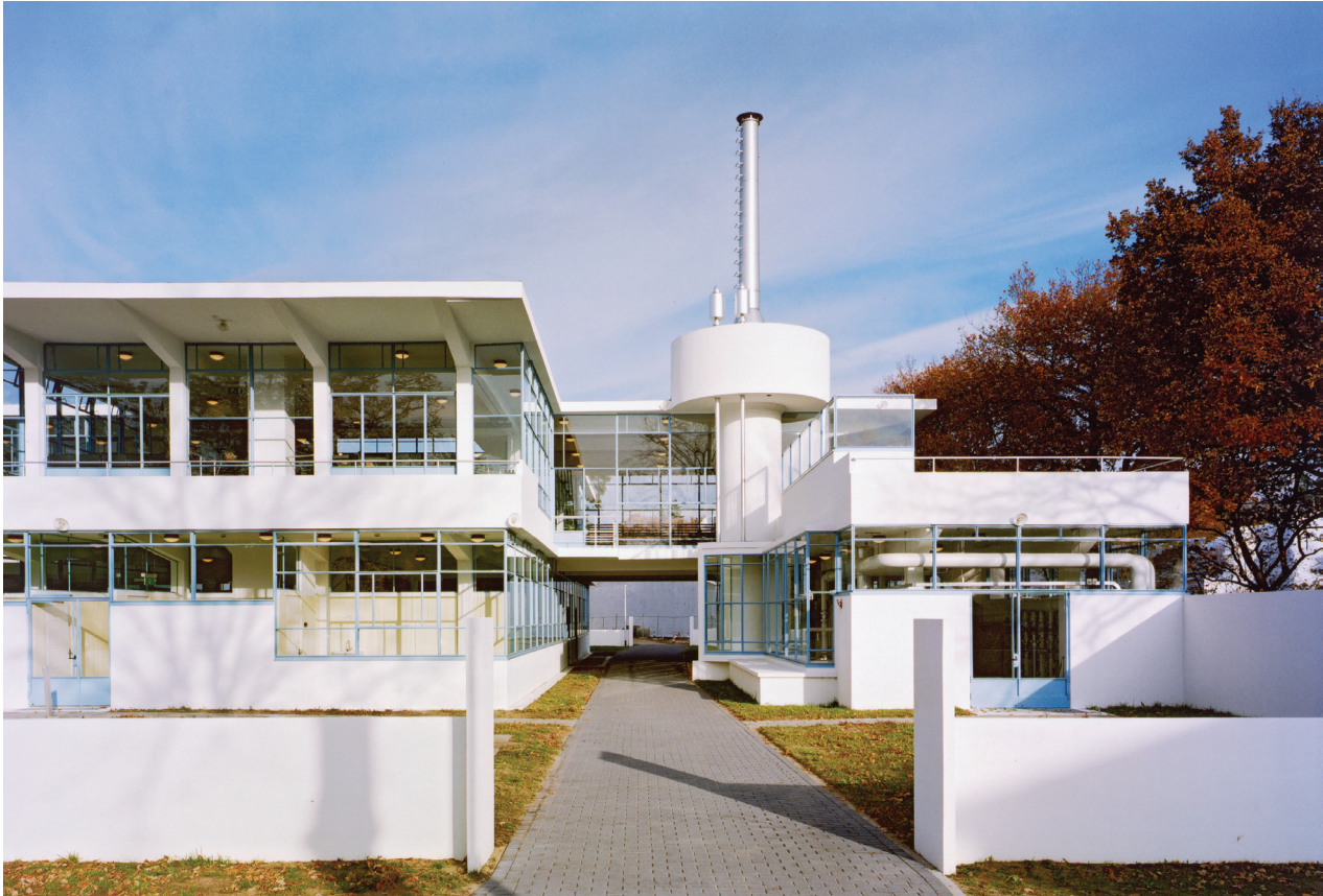
Fig. 1. “Zonnestraal” sanatorium, main building (1928) after restoration in 2003. View through one of the driveways that were restored

Il. 1. Sanatorium „Zonnestraal”, budynek główny (1928) po renowacji w 2003 r. Widok przez jeden z odrestaurowanych podjazdów