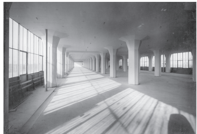
Fig. 4. The Van Nelle Factory interior shortly before completion in 1928. The octagonal mushroom-head columns allowed for the use of floorslabs without beams. The flush ceilings benefit daylight conditions.

Wspornikowe wysunięcie stropów zmniejsza momenty statyczne, co pozwala na bardziej ekonomiczne projektowanie płyt żelbetowych. Ponadto ściana osłonowa mogła przebiegać nieprzerwanie na całej wysokości budynku