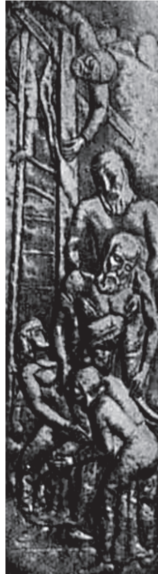
5. M. Szwarc, Descent from the Cross b. 1924, Illustration from Nowa Panorama , 1924