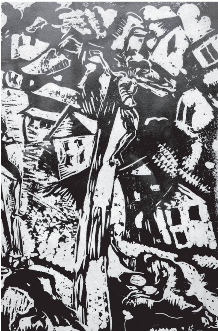
2. M. Szwarc, Crucifixion 1917, Collection of Dominique Torrès, Courtesy of Dominique Torrès