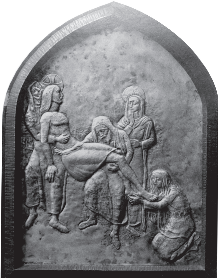
6. M. Szwarc, Entombment , c.1935, Archive of Dominique Torrès, Paris. Courtesy of Dominique Torrès