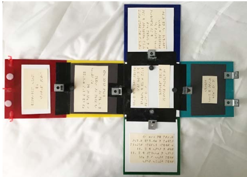
Figure 5b. Cube of Poetry (showing Braille inside when open)