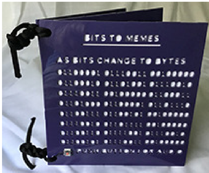
Figure 4. Bits to Memes (compares binary code with text)