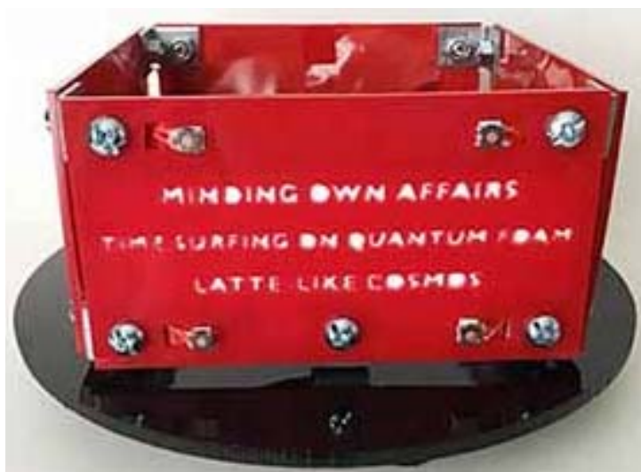
Figure 2. Merry-Go-Round Haiku showing a side view of a template with a haiku laser cut into it