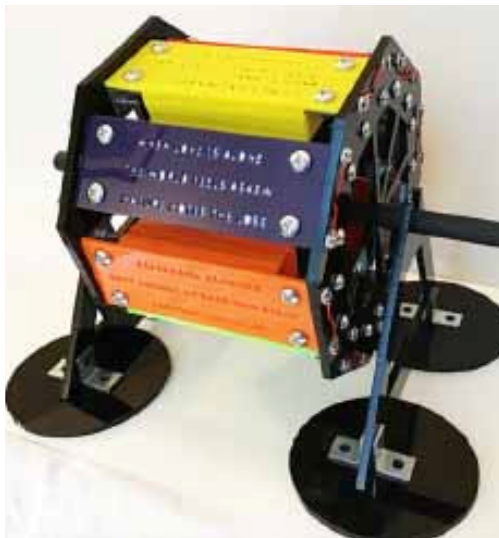
Figure 1. “Ferris Haiku” showing how templates can be rotated like a Ferris wheel

In Figure 1, note that the rectangular templates containing laser cut haiku poetry can be rotated like a Ferris wheel, allowing the templates beneath to become visible and ready to be read during the next rotation. There are buttons located on the side which can be pressed for an audio reading of the haiku poetry on each template and also for recording poetry by people visiting the art exhibit, making this piece “unfinished” as more poetry can be added throughout the exhibit period.