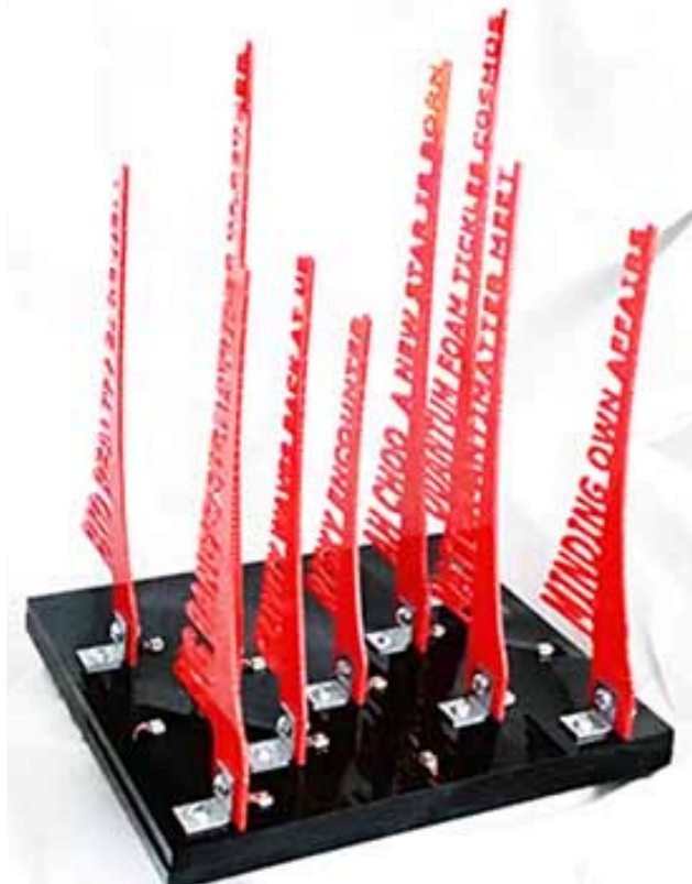
Figure 3. Sagittarius A X1 (Twotanka in an X shape arrangement share the middle line)

Figure 4 contrasts the text that we can read with the binary code that a computer can read. The actual lines of the haiku “Bits to Memes” are: on page 1 “as bits change to bytes”, on page 2 “base 2 shines revealing