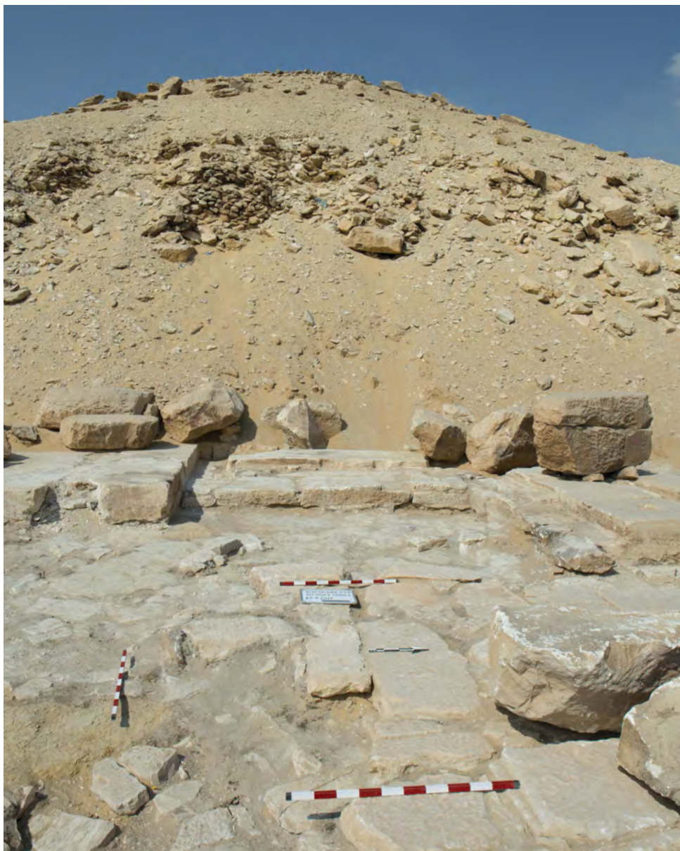
Fig. 8 View across the cleared offering hall looking west, showing the large limestone slab at its end, probably marking the position of the quartzite false door

2019: 212). 11 In the debris found in the joints of the blocks forming the lowermost row of the north wall of the hall, a number of calcite fragments with traces of well-carved decoration and signs were recovered (see fig. 14f here). These fragments might originate either from the altar in front of the false door or from the table at the north wall. 12 In or near the east wall, a basin and the opening of a drainage system must have existed. Except for one block of the east wall, all the masonry, however, has vanished in this part. The area immediately east of the offering hall is today marked by a deep hole. At the hole's east end, a huge block made of quartzite, displaying the characteristic cut of the drain on the upper side, juts out of the still existing masonry of the intact foundation (fig. 9). The width of the drain was