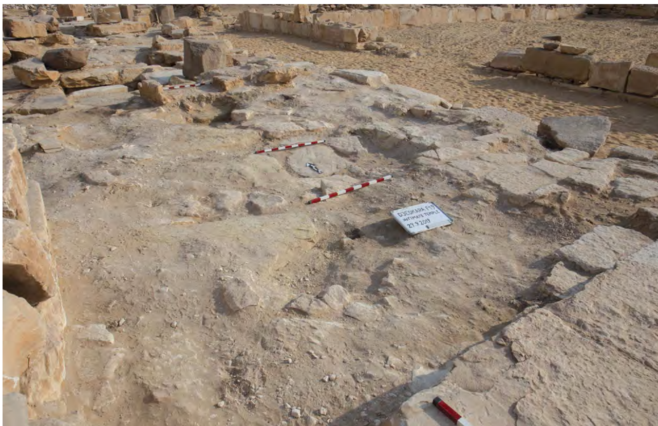
Fig. 6 The outlines of the large vestibule in the inner part of the temple are clearly visible although all of the original travertine floor has disappeared

( 10 \times 9 cubits), 8 and it did not follow the elongated form that is first attested in the temple of Sahure and remained characteristic in all the pyramid temples until Pepy II (Pepy I: 14 \times 6 cubits; Labrousse 2019: 131). For the first time, the vestibule received a third door located in the south wall connecting to further rooms. This feature remains present in all the successive pyramid temples of the late Old Kingdom. Traces of the door leading west into the antichambre carrée were found along the west wall. The door leading to the south was a small passageway (max. width: 80 cm) near the southwest corner of the room (fig. 4).