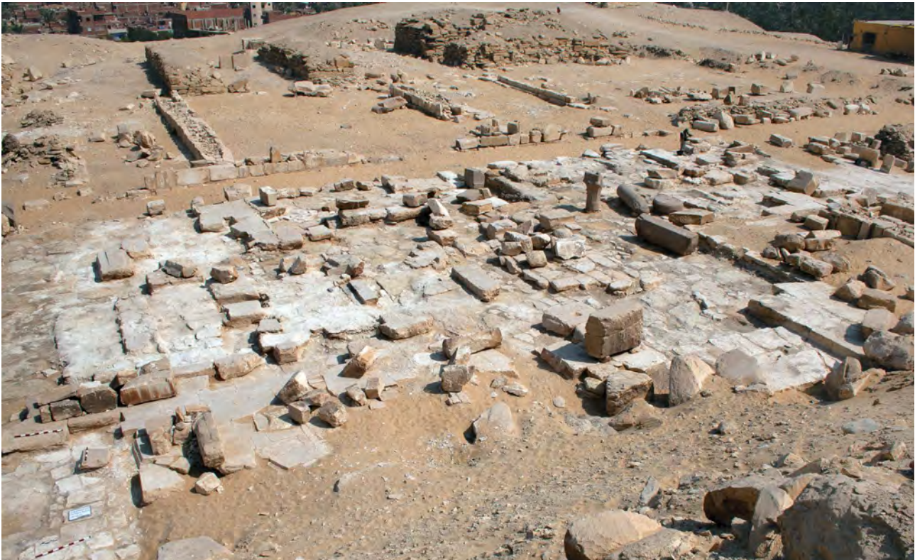
Fig. 1 The inner part of Djedkare's temple after clearing. In many areas the position and sizes of the rooms is well-discernible because of the white foundation of the (today missing) floors

The 12 th season in the pyramid complex of Djedkare had three main objectives: 1 the large area to the south of the open columned courtyard (Area T.f), the south-west corner of the king's pyramid and the pyramid courtyard (T.o) between the pyramid and the south façade of the inner temple and the cult pyramid as well as the inner part of the pyramid temple (comprising the areas T.b, T.m and T.n). 2