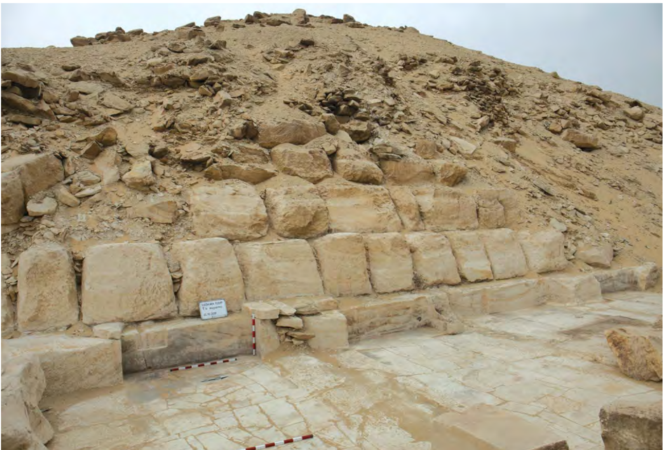
Fig. 7 The west end of the four magazines in T.b, built directly against the pyramid's core masonry