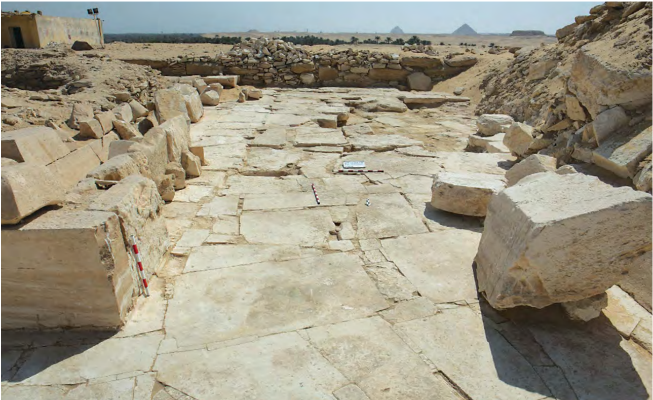
Fig. 3 The pyramid courtyard between the king's pyramid and the ka -pyramid complex, view to the south