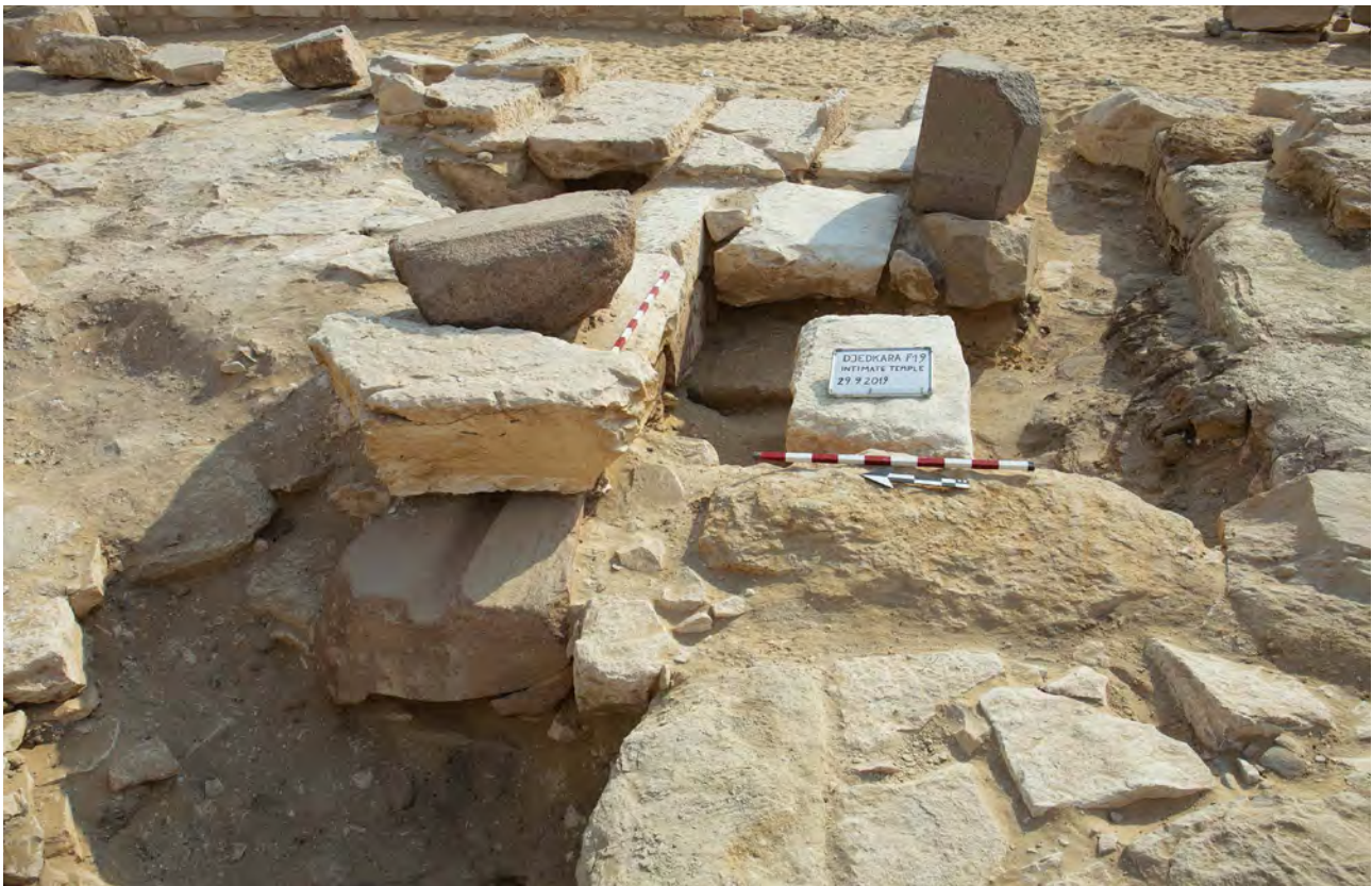
Fig. 9 View of the room with the five chapels (now missing) from the west. Below this room, a section of the still intact quartzite water drain is preserved

The central row of rooms to the west and accessed from the offering hall (traces of the door still remained), comprised four rooms orientated east west. While all four rooms had the same length (12 cubits) the width differed for each room (4 to 5 cubits). The first or southern room was a connecting room providing also