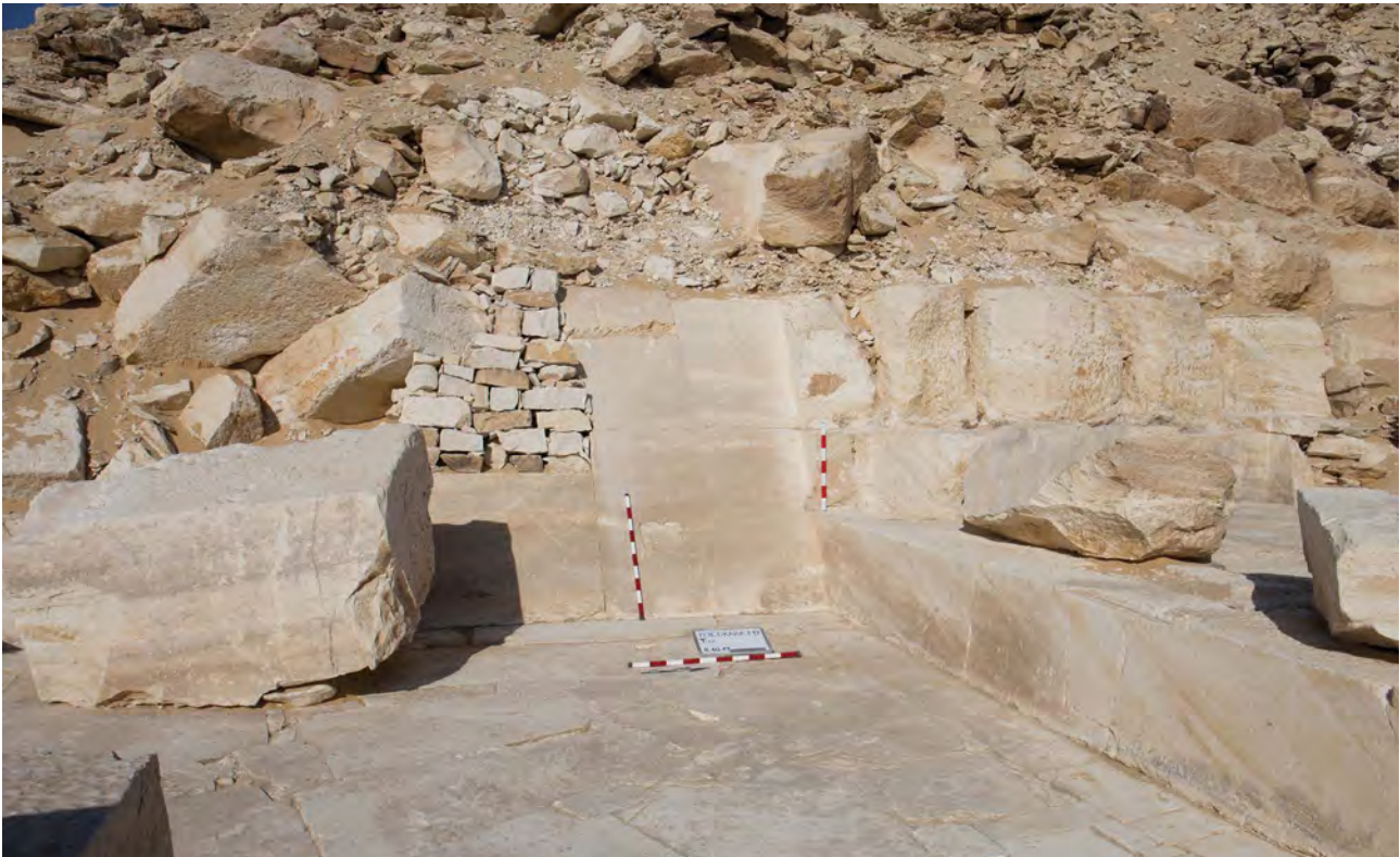
Fig. 5 The preserved casing of the king's pyramid south of the intimate temple. At this spot, the casing blocks are cut "L-shaped" since their north side forms part of the façade of the intimate temple

(= 5 cubits) (Maragioglio – Rinaldi 1977: 76 reconstructed 6 cubits). What is interesting about this is that a few remaining blocks along the east face were not part of the platform, but clearly added later. None of these blocks were connected with the platform. This feature is curious, since there is no convincing explanation (a miscalculation by the architects?) for initially building the two temple parts with an intermediary space of 5 m and then (during the construction of the temple) add an additional row of blocks along the east side in order to reduce the space in the transverse corridor. However, this observation in this part of the temple is not the only puzzling feature of Djedkare's building (see for instance the different lengths of the core walls of the pr-wrw , the southern one receiving an addition at the west side).