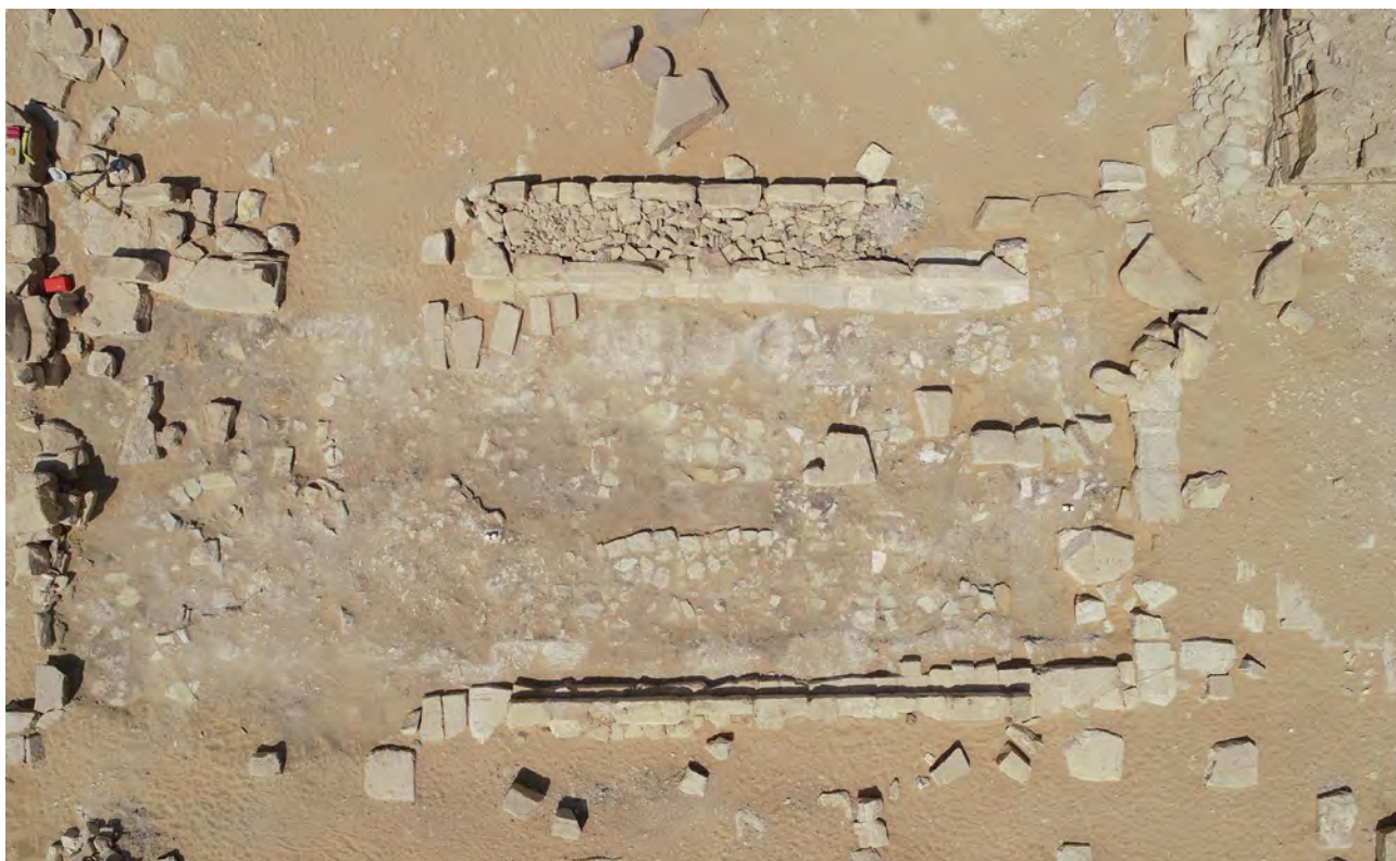
Fig. 2 Aerial photo of the west side of T.f after clearing the site. Except the sidewalls, the few floor blocks in place offer little evidence for reconstructing the layout and sizes of the rooms in this part of the temple

of the ka -pyramid precinct is 5.25–8 cm (=10 cubits). 3 The width of the courtyard along the north side shows two different distances. At the west end, the distance is 3.14 m (= 6 cubits), while at the east end it narrows down to 3.04 m. This change is due to the fact that the north enclosure wall of the ka -pyramid precinct does not run straight east-west, but slightly askew (fig. 4). The reason for this deviation is not clear and might simply be a mistake by the pyramid builders.