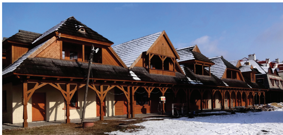
Il. 1. Biłgoraj, „Kresowe miasteczko”, rynek, pierzeja północna