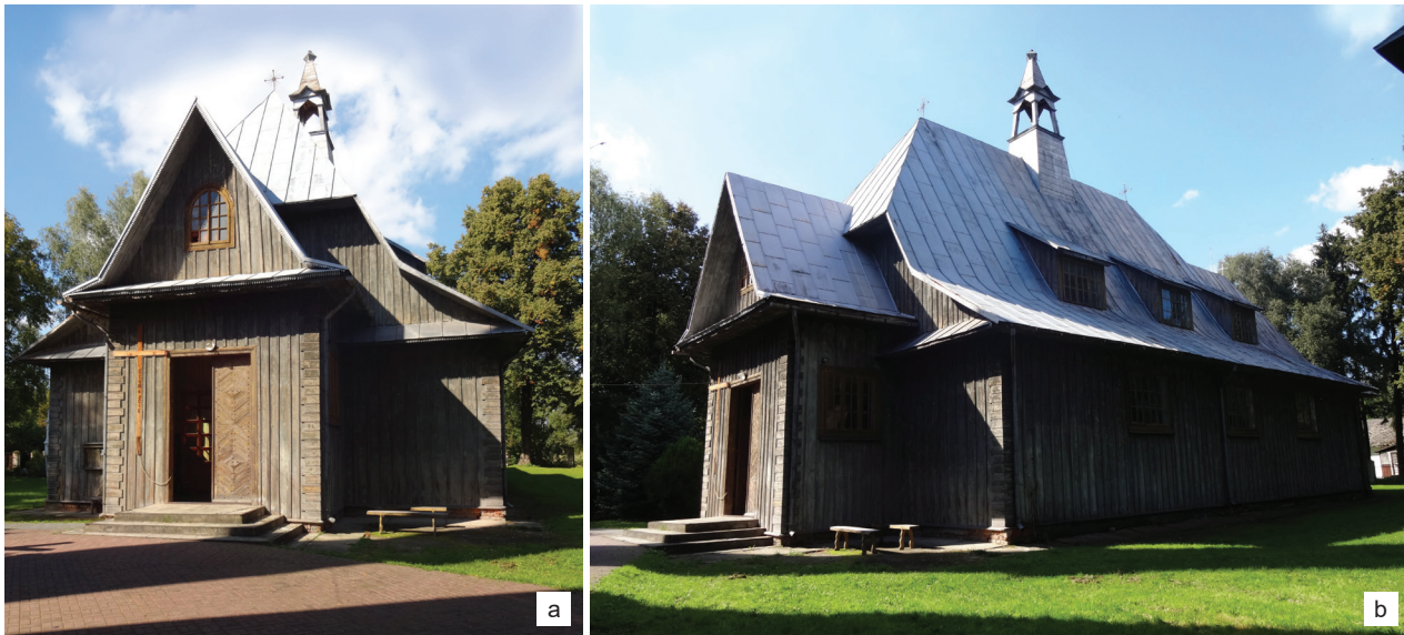
Fig. 10. Tworzyców, church of St. Apostles Peter and Paul (1932–1933): a) façade, b) east elevation