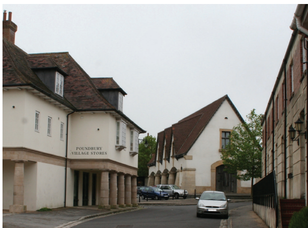
Fig. 5. Poundbury, Cambridge Walk – city centre – market square

Il. 5. Poundbury, pasaż Cambridge – rynek