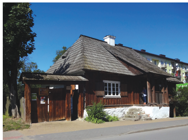
Fig. 6. Biłgoraj, open-air museum “Sievemakers Farm”, front elevation

Il. 5. Poundbury, pasaż Cambridge – rynek