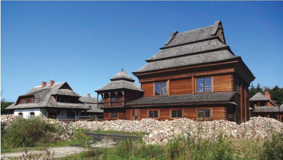
Fig. 7. Biłgoraj, “Borderland Town”, replica of the synagogue from Wolpa, southern façade (photo by A. Tejszerska, 2020)

Il. 7. Biłgoraj, „Kresowe miasteczko”, replika synagogi z Wolpy, elewacja południowa (fot. A. Tejszerska, 2020)