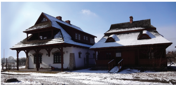
Fig. 4. Biłgoraj, „Borderland Town”, market square, western frontage