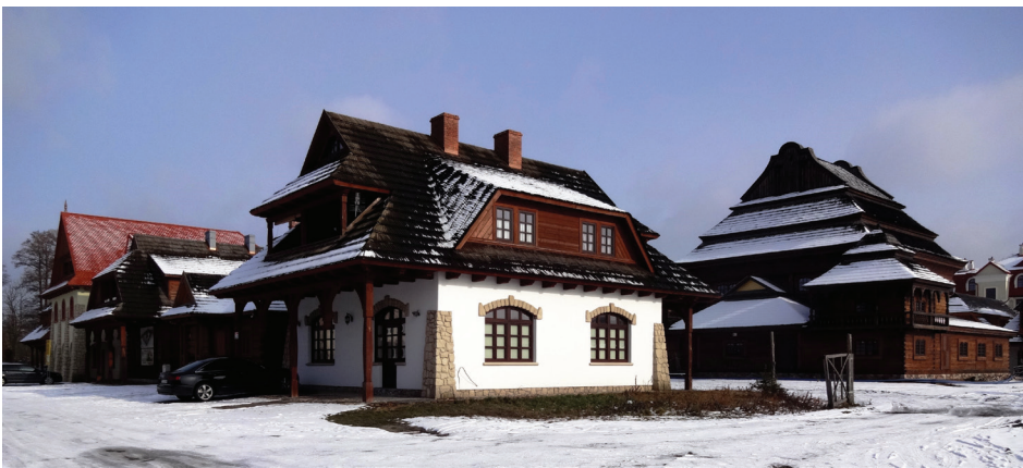
Fig. 8. Biłgoraj, “Borderland Town”, view of the market square from the southwest corner (photo by A. Tejszerska, 2018)

Il. 7. Biłgoraj, „Kresowe miasteczko”, replika synagogi z Wolpy, elewacja południowa (fot. A. Tejszerska, 2020)