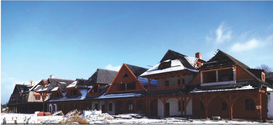
Fig. 3. Biłgoraj, „Borderland Town”, market square, eastern frontage