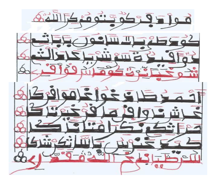
Figure 3. Instance of a poem with a mixed stanza by Garba Gashuwa

Other instances of mixed stanzas are from a poem named Mulki sai wanda ya san shi [Governing is for Those who have Knowledge about it] with a combination of one (1), three (3), and five (5) lines stanzas.