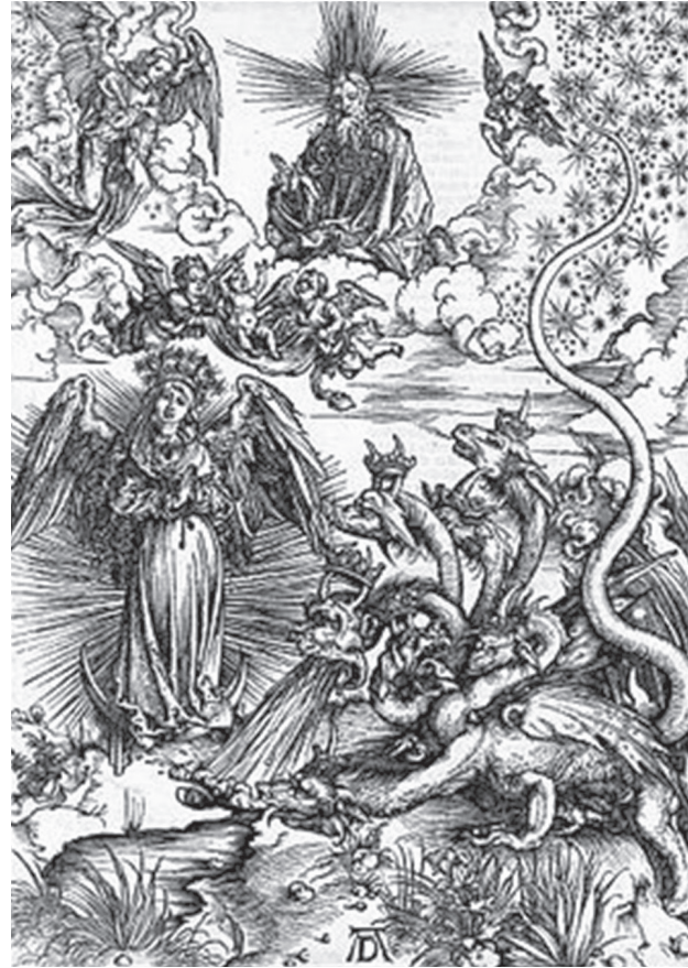
Fig. 2. Albrecht Dürer, The woman of the Apocalypse and the seven-headed dragon (Latin Edition: 1511 – second edition, source: The Metropolitan Museum – metmuseum.org)

Il. 1. Albrecht Dürer, Dziewica ukazująca się świętemu Janowi – pierwsza strona Apokalipsy (źródło: The Metropolitan Museum – metmuseum.org)