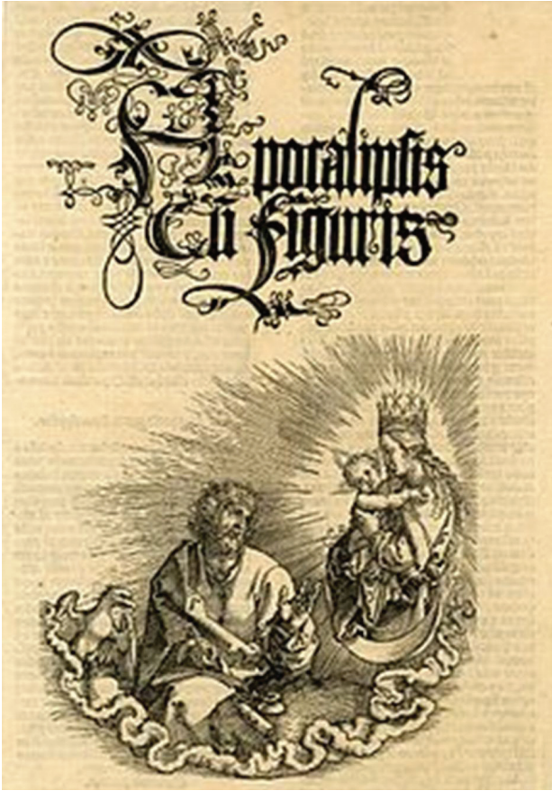
Fig. 1. Albrecht Dürer, The Virgin Appearing to Saint John , no date – front page of The Apocalypse , (source: The Metropolitan Museum – metmuseum.org)

Il. 1. Albrecht Dürer, Dziewica ukazująca się świętemu Janowi – pierwsza strona Apokalipsy (źródło: The Metropolitan Museum – metmuseum.org)