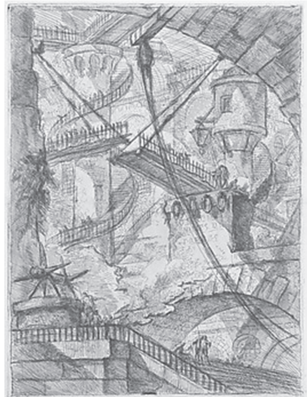
Fig. 4. Giovanni Battista Piranesi, The Drawbridge , 1749–1750

Il. 3. Giovanni Battista Piranesi, Carceri d'invenzione – Wyobrażalne więzienia , pierwsza strona, 1749–1750