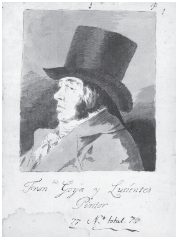
Fig. 5. Francisco de Goya y Lucientes, Los Caprichos n°1, front page, 1797-1799

Il. 5. Francisco de Goya y Lucientes, Kaprysy, nr 1 , pierwsza strona, 1797-1799 (źródło: Real Academia Bellas Artes San Fernando – realacademiabellasartessanfernando.com)