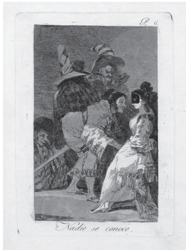
Fig. 6. Francisco de Goya y Lucientes, Los Caprichos n° 6 – Nadie se conoce , 1797-1799 (source: Real Academia Bellas Artes San Fernando – realacademiabellasartessanfernando.com)

Il. 5. Francisco de Goya y Lucientes, Kaprysy, nr 1 , pierwsza strona, 1797-1799 (źródło: Real Academia Bellas Artes San Fernando – realacademiabellasartessanfernando.com)