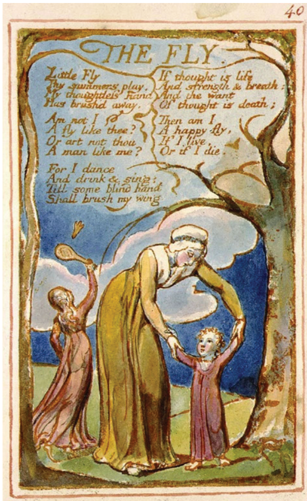
Fig. 7. William Blake, Songs of Innocence and of Experience – The fly, 1789

Il. 7. William Blake, Pieśni niewinności i doświadczenia, 1789