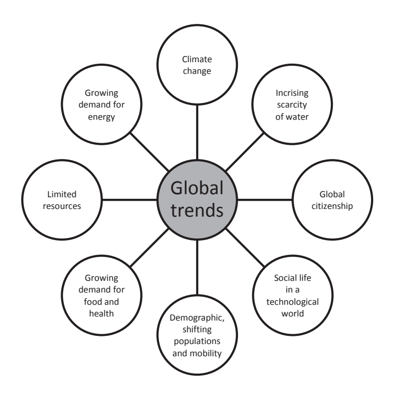
Figure 1. Global trends (Maynard, Harper 2011)

irreversible consequences of new discoveries, resulting inter alia from the increasing scale of influences and time pressure during the decision making process. Another factor supporting the need for RRI is a growing distrust for the achievements of science among the public, which may be due to the high advancement of knowledge necessary to understand the innovations introduced.