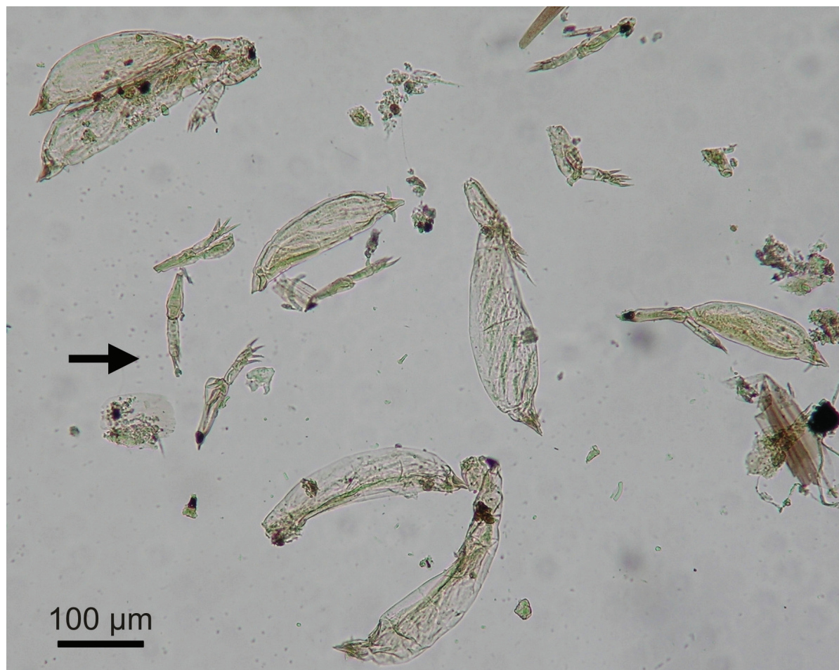
Fig. 1. Hesperomyces virescens thalli removed from the elytron of Harmonia axyridis from Divna. The arrow shows a group of thalli without perithecia.

The distribution of H. axyridis in Croatia, based on the records reported by Mičetić Stanković et al. (2011), Ivezić et al. (2011) and this paper, is shown in Fig. 2. Our records from Pelješac Peninsula are about 85-90 km SE of the town Sinj, the southernmost place in Croatia so far reported as a locality of H. axyridis (Mičetić Stanković et al. 2011).