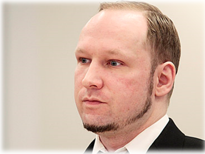
Fig 2. Anders Behring Breivik