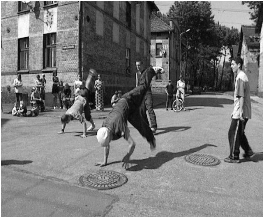
Final scene – life through dance

Another ordinary morning at Bobrek; the unemployed are sitting in front of their buildings, the collectors of scrap and coal return home after “work”, children are playing in the backyards. In a small, dingy little basement our heroes arrange a youth club to teach their friends how to perform break dance. They are not the uncertain, fearful boys of the year before. They have changed, gained a new status in the district. And suddenly dance moves into the street and its inhabitants begin to swirl. The final scene of the film thus becomes a reversal of its ominous beginning.