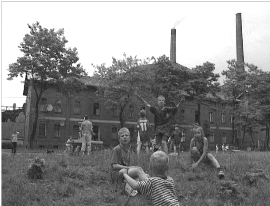
Bobrek – the workers' district of Bytom

"This place is a shithole and nobody's gonna change it. Life sucks here. Your own people will f***ing knock you down" – adds another man in the bar. It is the young people who are in the worst situation, often witnessing the worsening of the socio-economic conditions at their homes. Kids are left unattended and often turn to alcohol and drugs, and then give up school and end up in conflict with the law.