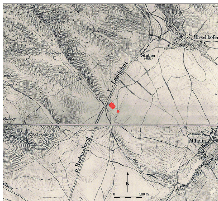
Fig. 1. Altheim, Markt Essenbach, Landshut District, Lower Bavaria. Location of the Altheim earthworks. The smaller earthwork II to the southeast of Altheim I is affected by a sunken path resulting in a seriously damaged southwest ditch (Map basis: Urpositionsblätter 530 Mirschkofen [1874] und 559 Landshut Ost [1876]) (Bavarian survey office, Munich)

Already at the time when the excavation trenches were laid out, the serious impact of soil erosion was evident from the truncated profiles of the humus-rich Luvisol. North-west of the test trench opened in 2013, a slope catena comprising twelve Pürkhauer cores reaching a depth of up to 1.8 m was laid out, extending from a low rise of the loess into the valley of the Eichelbach.