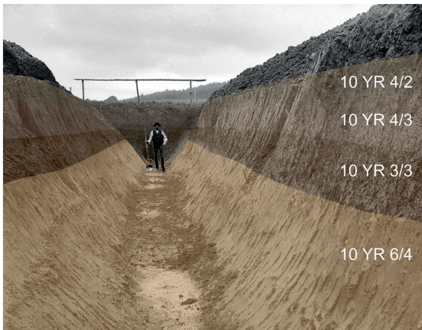
Fig. 3. Altheim, Markt Essenbach, Landshut District, Lower Bavaria. View to the northwest from the middle ditch I North, excavated in June 1914 in the eastern part of earthwork I. Clearly identifiable in the outer side of the ditch, from top to bottom, are: the dark Ap horizon, the lighter Al horizon and the dark Bt horizon, which have developed from the loess. Distinction of the soil horizons, showing the Munsell colour notation, by R. Schmidt

On several excavation photos from 1914, fully-developed Luvisols can be identified in the sides of the middle ditch (Fig. 3). Even in the absence of a scale, the approximate thickness of the horizons and the depth of the ditch excavated at that time can be calculated from the stature of the excavation worker (roughly 1.7 m) and the shovel that he is holding (1.5 m). The Ap horizon could have had a thickness of about 0.3 m, the Al horizon could have been about 0.2 m thick and the Bt horizon below it could have been about 0.5 m thick. Accordingly, the total thickness of the soil could have been about a metre. The depth of the excavated ditch can be reckoned as being about 2.3 m, whereby we can add to this a further 0.2 m that was not excavated at the time (Fig. 4). A century later, the thickness of soil cover has been reduced to 0.6 m. The Ap horizon – 0.3 m thick, as before – is directly underlain by a Bt horizon that now has a maximum thickness of only 0.3 m. No Al horizon is present any longer. The depth of the ditch no longer reaches about 2.5 m, but rather only about 2.1 m. Thus, in the course of a century about 0.4 m of the ditch feature has been lost through soil erosion. In comparison with the total amount of erosion since the creation