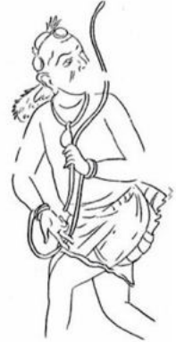
Fig. 5. Ajanta, cave II, right chapel, right side-wall (after Zin, 2015: 390, Fig. 1)