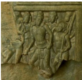
Fig. 8. Nagarjunakonda, site 37, Archaeological Site Museum, No. 36 (after Zin, 2015: 394, Fig. 13)