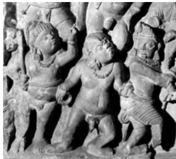
Fig. 2. Ahicchatra, National Museum New Delhi (after Zin, 2015: 394, Fig. 15)