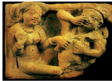
Fig. 9. Mathura Government Museum, No. 2795 (after Zin, 2015: 393, Fig. 10)