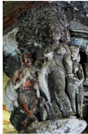
Fig. 7. Ajanta, cave I, right pillar at the entrance to the shrine antechamber (after Zin, 2015: 392, Fig. 5)