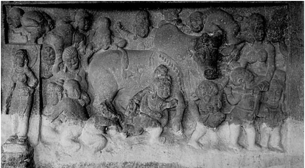
Fig. 11. Ghana, frolicking next to the bull Nandi. Relief fragment. cave temple No. 21 in Ellora, 7th century, Kalachuri dynasty (after Vorobyeva, 2017: 782, Fig. 129)