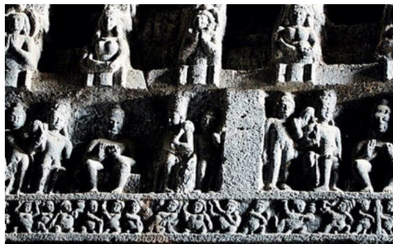
Fig. 3. Decor of the vault of the cave Buddhist chaityagriha. Decor of the vault of the cave Buddhist chaityagriha No. 10 (Vishvakarman temple) in Ellora, 8th century, Early Chalukya dynasty (after Vorobyeva, 2017: 783, Fig. 134)