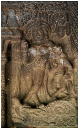
Fig. 6. Ajanta, cave V, porch, main entrance to the cave, door frame, right side (photo Rajesh Singh, after Zin, 2015: 392, Fig. 6)