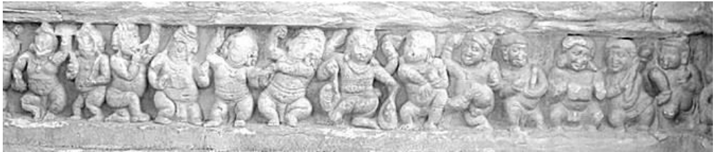
Fig. 1. Ghana “supporting” Shaivite cave temple. Shaivite cave temple No. 2, 7th century, Badami, Early Chalukya dynasty. Photo from (after Vorobyeva, 2017: 782, Fig. 131)

form and practitioner, the entire knowledge is lost. Heritage art forms need to be introduced in “gifting culture,” especially by large companies with huge gifting budgets. By procuring art and craft objects from social enterprises, we can ensure the sustainability of many of these ancient traditions that are in danger of extinction. Hence, they are need to be conserved.