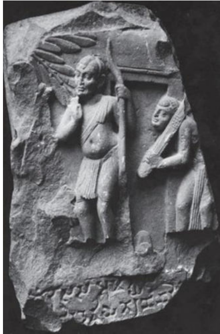
Fig. 10. Katra, Mathura Government Museum, No. 54.3768 (after Zin, 2015: 396, Fig. 19)