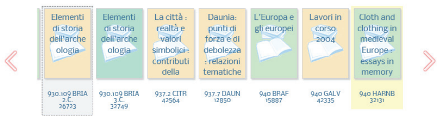
Figure 2. A virtual shelf