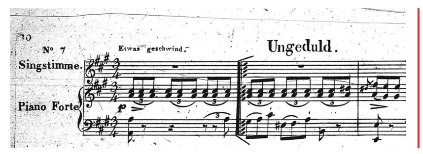
Illustr. 3: Beginning of Ungeduld in the first edition (Wien: Sauer & Leidesdorf, ca. 1824, Plate Set 502).

Furthermore, this fact gets strenghten by a comment of the composer to his women's song Von Ida D 228: "If this song is sung by tenor, the accompaniment will permanently fall down an octave."<sup>38</sup> Obviously it was no problem for Schubert to hear verses like "Kehr' um, kehr' um! / Zu deiner Einsamtrauernden! / Zu deiner Ahnungsschauernden! Mein Einziger, kehr' um!" ("Turn back, turn back! / To your lonely [female] mourner! / To your intuitive trembling one / My only one, turn back!") being sung by a man.