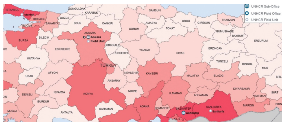
Map 1. Provincial breakdown of Syrians with Temporary Protection Status (UNHCR Turkey, 2019).

According to Turkish authorities, 45% of Syrian refugees are under the age of eighteen, while 38% are under the age of fourteen. Furthermore, approximately 80% are younger than 45 (DGMM, 2020). The 15-18 age group is roughly 250,000 people. Although we cannot consider the members of this age group as adults, mentioning them separately is justified by the fact that the upper age limit for obligatory schooling in Turkey is fourteen years. So, the participation of this age group in education provided by the Turkish government cannot be regarded as compulsory (Hürriyet Daily News, 2019b). The proportion of children aged four or younger is also significant: more than 490,000, so around 13% of the Syrian refugee population has not yet reached the age of five (DGMM, 2020).