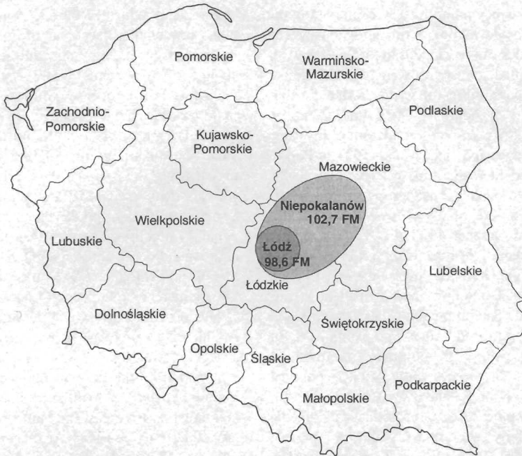
Fig. 1. Radio Niepokalanów coverage at the beginning of 2005

The broadcasting station is planning a farther increase of coverage to get up to the residents of the entire central Poland. Irrespective of traditional forms of transfer reception of Radio Niepokalanów is possible for a wider group of listeners because the programmes are broadcast by Syriusz 2 satellite and worldwide browsers can listen to programmes by the Internet. In the same year Radio "Emaus" –