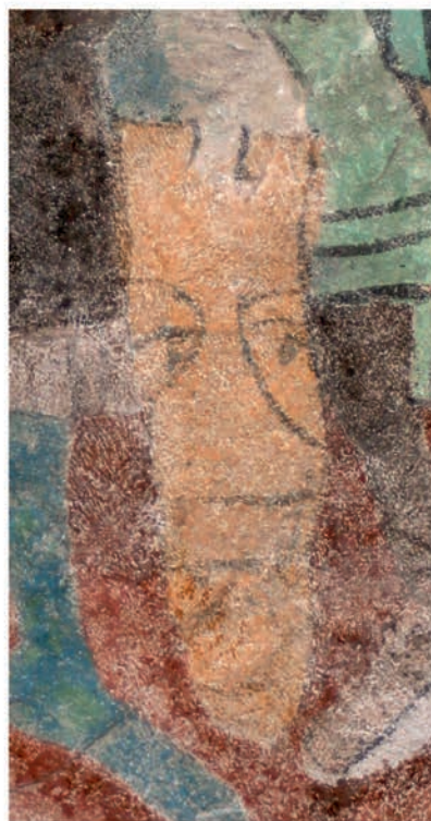
Fig. 1. The shield depicted on The Crucifixion of the Christ scene from frescoes of St. Martin's church in Wichów