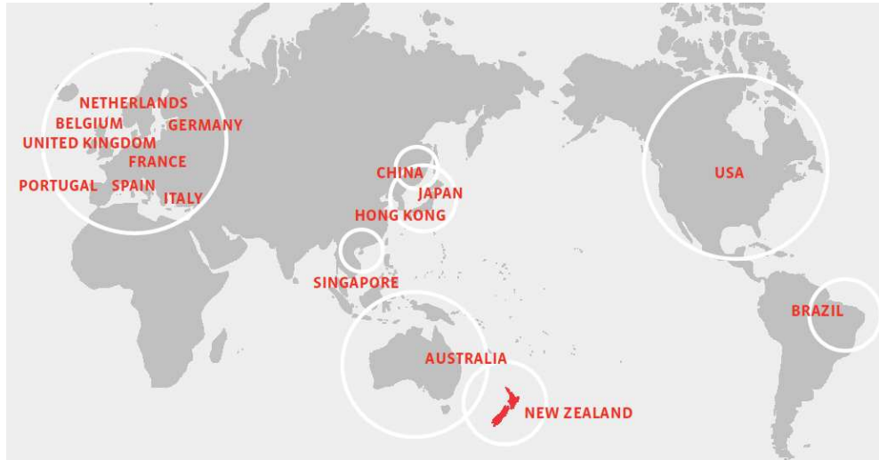
Graph 1. LOHAS markets identified globally