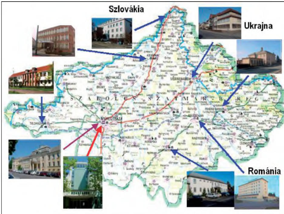
Table 1: Police units of Szabolcs-Szatmár-Bereg County

The Police of the Hungarian Republic (hereinafter as the Police) are a state, armed law enforcement body fulfilling crime prevention, criminal investigation, public administration and public order duties. The central Police body of national authority is the National Police Headquarters (Országos Rendőr-Főkapitányság, ORFK).