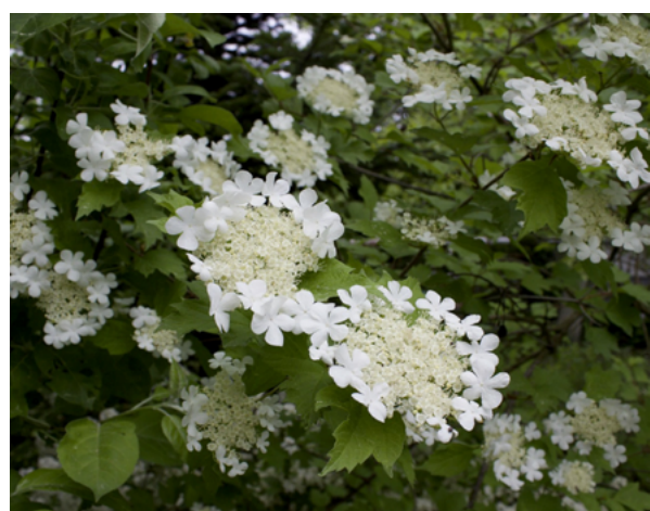
Figure 3. Shrub of viburnum coral with flowers

Many species of Viburnum are widely known and have been used for many years in folk medicine due to its valuable properties. They are also characterized by antibacterial, anti-inflammatory, sedative, hepatoprotective, antinociceptive and anti-asthmatic properties. 6-9 Numerous biologically active compounds are responsible for these properties which originate from various species of Viburnum . 10-16 The scientific literature presents the results of phytochemical studies confirming the presence of triterpenoid compounds 17-22 , iodoids, 23-25 diterpenoid/diterpenes 26,7 , vibroids, lignans 31-34 , flavonoids 35-36 , polyphenols 18-27 , and vitamins in fruit, leaves, twigs of various species of Viburnum (table 1). These compounds are an important group among compounds derived from natural products in the prevention and treatment of tumors. Our review presents the characteristics of cytotoxic and antineoplastic extracts and compounds isolated from various species of Viburnum .