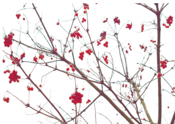
Figure 2. Shrub of viburnum coral with ripe fruits