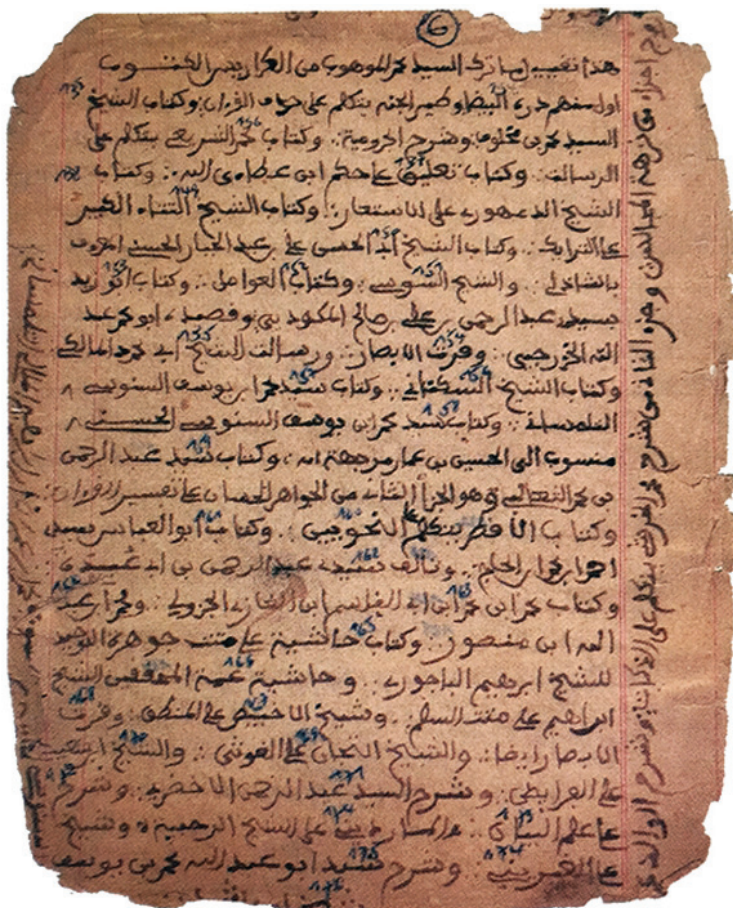
Manuscripts inventory from the Algerian collection

It is to be hoped that more inventories of book collections, similar to the two described in this article, will come out from oblivion and become available to historians, helping to enhance our knowledge of book preservation and circulation in the Arab World.