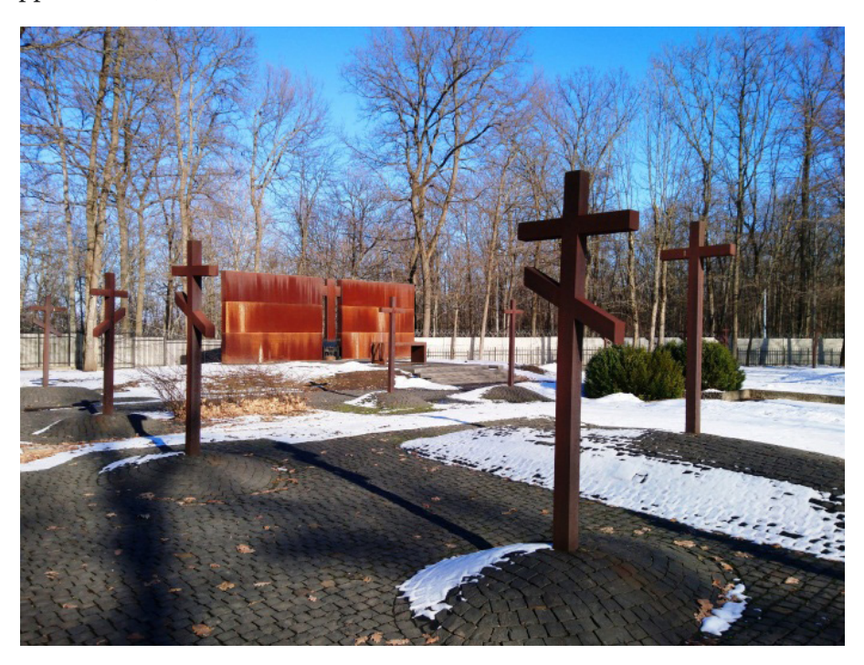
Fig. 7. Memorial to the Victims of Totalitarianism in Kharkiv, opened in 2000.

coming to Kharkiv. At the same time, researchers note that in the minds of the city's residents the memorial remains mostly "Polish," as it is little integrated into the local commemorative calendar (Kas'ianov, 2018b, pp. 106–107).