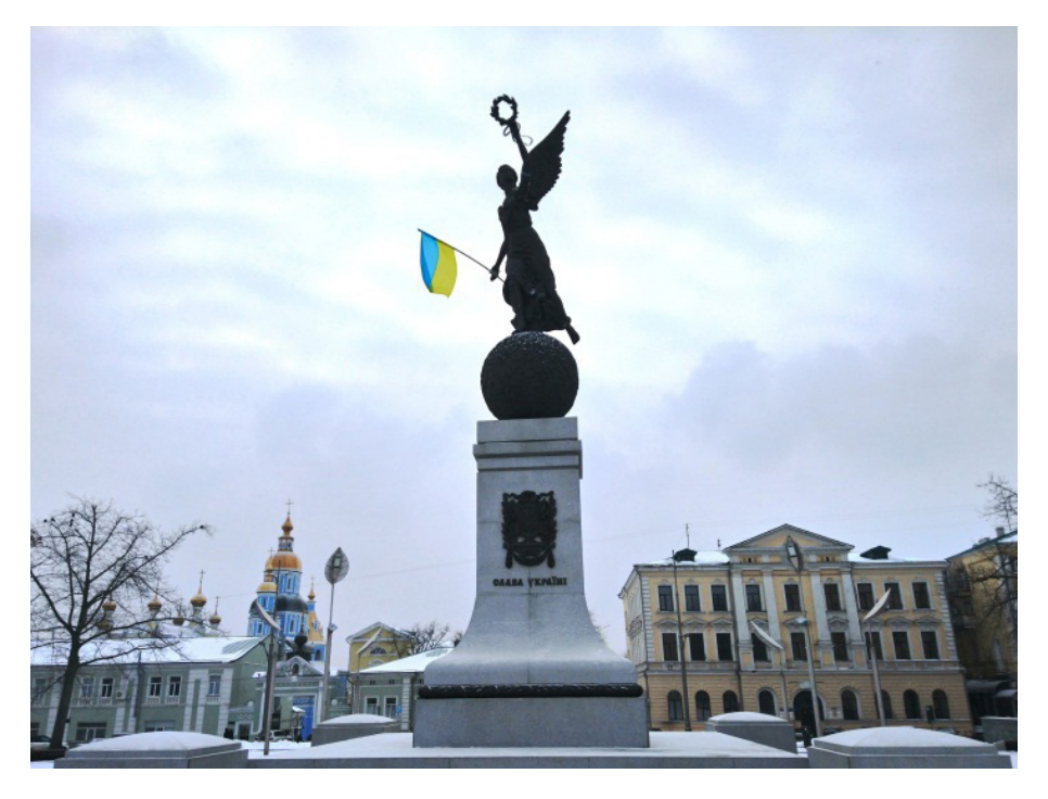
Fig. 8. The monument "Flying Ukraine" in Kharkiv, built in 2012.

in the shape of a trident. The figure of a 10-year-old girl was placed at the foot of the column. As is generally known, in 2009, the composition made it on the list of the top 10 most tasteless monuments to Ukraine's independence (Top-10, 2009). In 2012, the monument was dismantled – partly due to its kitschiness, partly due to poor placement (in the middle of a traffic intersection), and ostensibly because of the reconstruction of the square in which it was located. Kharkiv boasts another independence monument – the "Flying Ukraine," built in 2012 on the site of a monument in honor of the proclamation of Soviet power in Ukraine (1975–2011). The new sculpture was unveiled on the eve of the 21st anniversary of Ukraine's independence and on Kharkiv's City Day. Almost immediately, it was criticized for its allegedly extremely unimaginative and archaic design. The idea of the monument was handed down "from above," without dialogue with the community or research into the ritual practices of the city's residents.