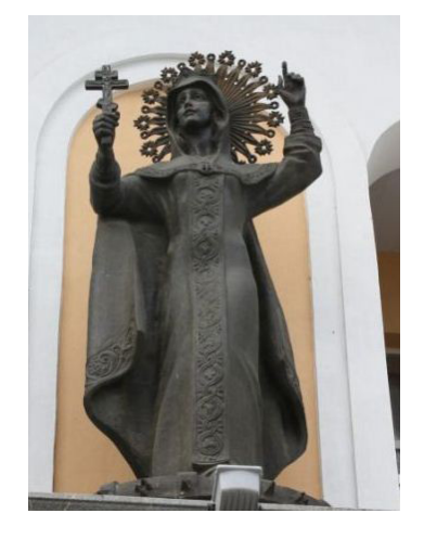
Fig. 5. The monument in honor of the Holy Martyr Oleksandr in Kharkov and the statue of the Great Martyr St. Catherine in Dnipro.