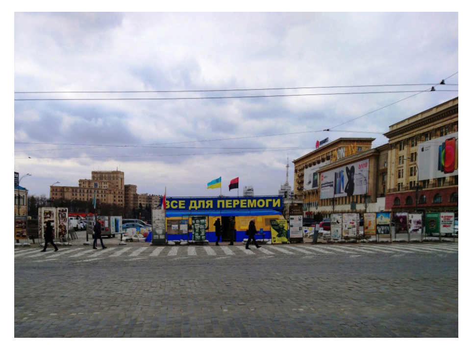
Fig. 9. The public memorial "Everything for Victory" in Kharkiy, opened in 2014. Photograph by Yevhen Rachkov, 2021.

of the subject cities was gained by "public memorials" spontaneously created by citizens in honor of men and women killed during the events of the Euromaidan and in the zone of the Anti-Terrorist Operation (ATO) in eastern Ukraine. Such makeshift memorials usually consisted of portraits of the fallen, flowers, candles, and prayer items. They also included shell fragments and military equipment from the zone of the ATO and similar meaningful objects (Kas'ianov, 2018b, pp. 135–142). In recent years, monuments have been built to honor the defenders of Ukraine who died in the ATO: in Dnipro in 2017 (Ratsybars'ka, 2018), in Kharkiv (U Kharkovi vidkryly, 2019) and Zaporizhzhia (U Zaporizhzhi vidkryly, 2019) in 2019, in Odesa in 2020 (Vechnaia pamiat', 2020). At the same time, the forms of commemoration often become the subject of lively discussions. For instance, in 2018 several public organizations initiated the installation of a stone cross with trident in the Alley of Heroes in Dnipro, which caused offence to some ATO veterans, who saw this memorial complex as a space of unity for people of different faiths and nationalities (Ratsybars'ka, 2018). The commemoration of the defenders of Ukraine will certainly be continued in the future – for instance, through the establishment of special museums.