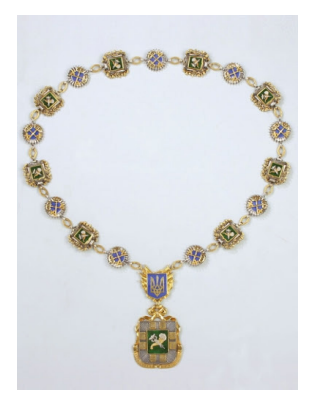
Fig. 4. The livery collar of the mayor of Kharkiv (2010).

cultural models. There is no established tradition of using municipal office insignia in Ukraine.