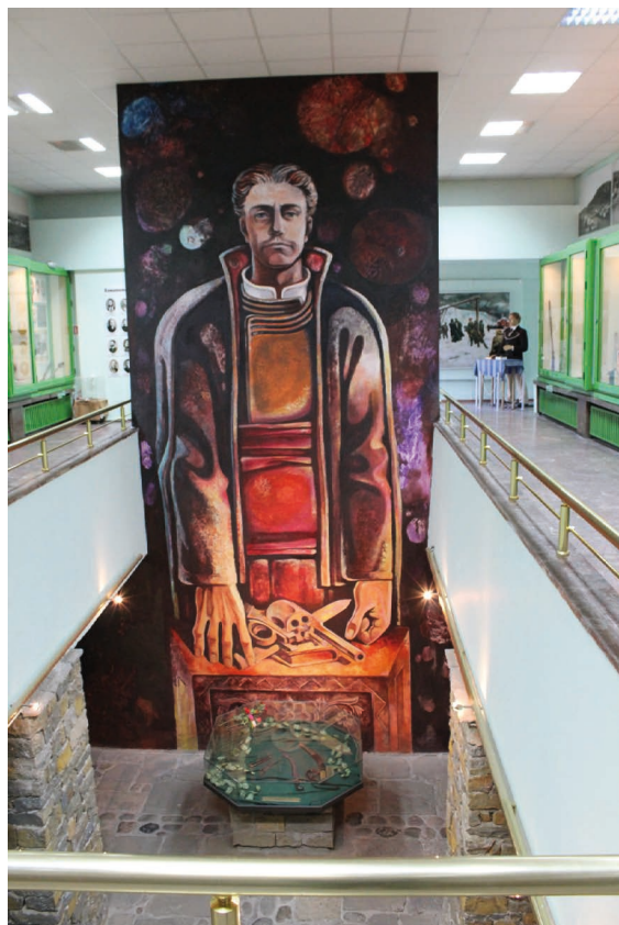
Photo 2. The personal weapon of Vasil Levski in Lovech

where the information about the relic tells, albeit briefly, about the history of its use. The chronological (event) contextualization is supplemented with a figurative one, as the subject is located in front of a reconstruction of an insurgent uniform from the April Uprising, which represents the vision of the voivode.