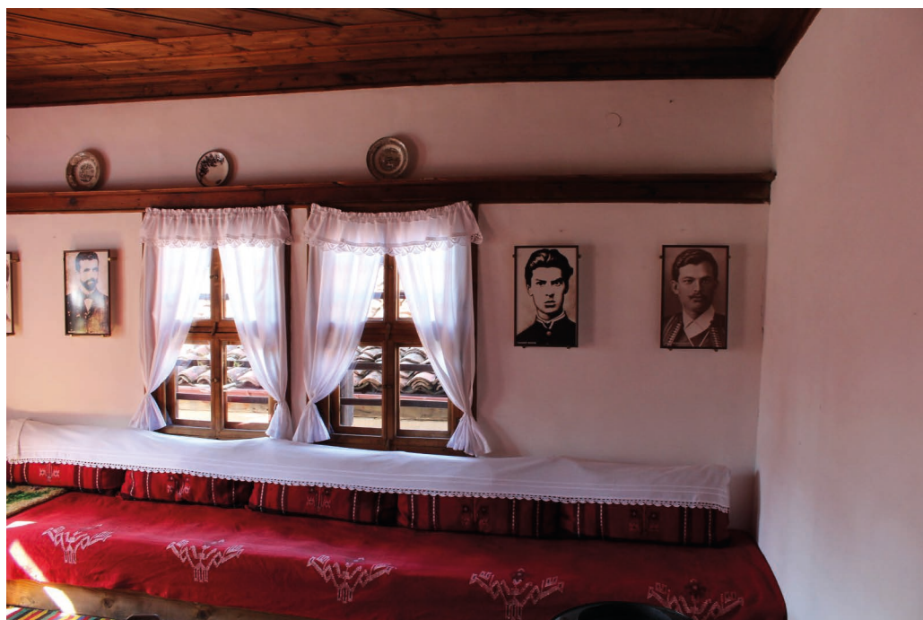
Photo 3. The use of walls as exhibition space for images at the Georgi Benkovski Museum

has merit for his virtues. Constructed in an extremely identical way, this setting contains „mandatory” elements that are observed in all house museums: a fireplace, a table and three-legged chairs, rugs and carpets, utensils, chests, baby swing, spinning wheel, paintings and photos on the walls. The claim to recreate an authentic environment is violated precisely by the last element, which is always at odds with the reconstructed period. For example, in the annotated room in the Georgi Benkovski House Museum in Koprivshtitsa, we see hanging portraits of the revolutionaries in the April Uprising from the region, which were especially popular during the period of socialism. In the Rayna Knyaginya House Museum, next to the place where she hid the rebel flag, we see a photograph of her from 1901 with the same flag. In this way, the walls go beyond the context of the recreated setting and perform the functions of museum showcases, without being such. Another common point in the reconstructions of an authentic environment is the presentation of tools or products related to the livelihood of the hero's family.