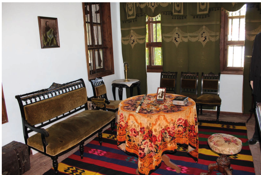
Photo 5. Interior of the Dobri Voinikov House Museum (Fot. Iskren Velikov, 2017)

are complemented by modern European ideas of the era, and innovations in the life of Bulgarians happen only for the better.