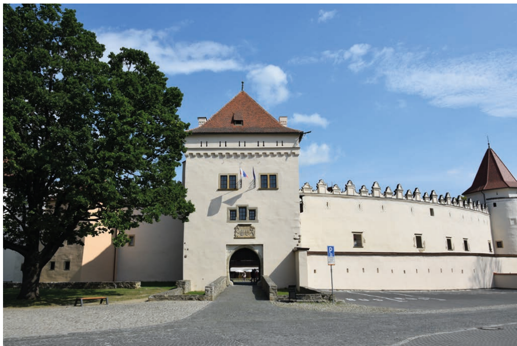
Fot. 8. Current view of the castle - the seat of the Museum in Kežmarok

Castle as the construction of the century. This lengthy process of the reconstruction was due to an inconsistent approach to the construction work (at times the work was suspended or the workers were moved to other workplaces) or work was done in the wintertime. The inconsistency of the work regarding the reconstruction of the castle caused many problems which were remedied in the past fifteen years. These shortfalls should have been remedied as a part of the overhaul of the castle, but these works were not fully carried out earlier. The poor condition of the roof required its replacement over almost the entire castle building.