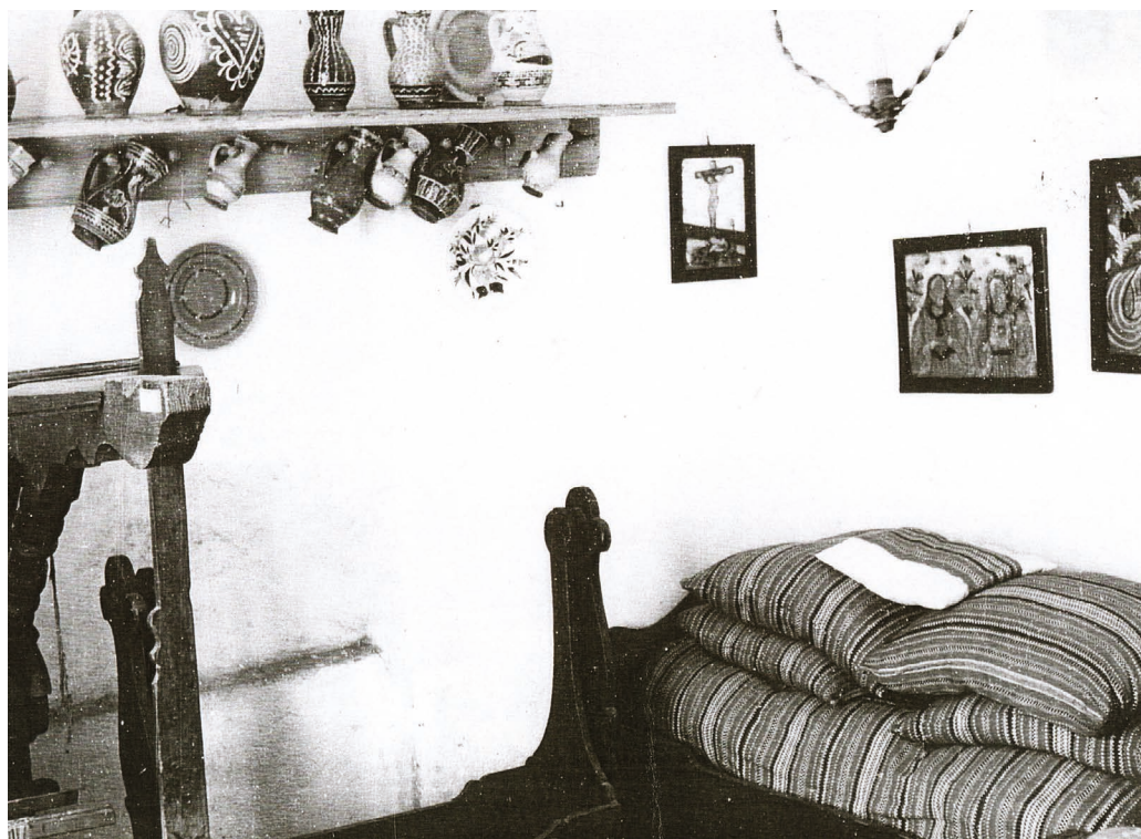
Fot. 5. First exhibitions in the castle

logical items, ceramic products dating to the 19 th century, 17 th -century weapons, pictures painted on glass and cloth, and minerals or fossils.