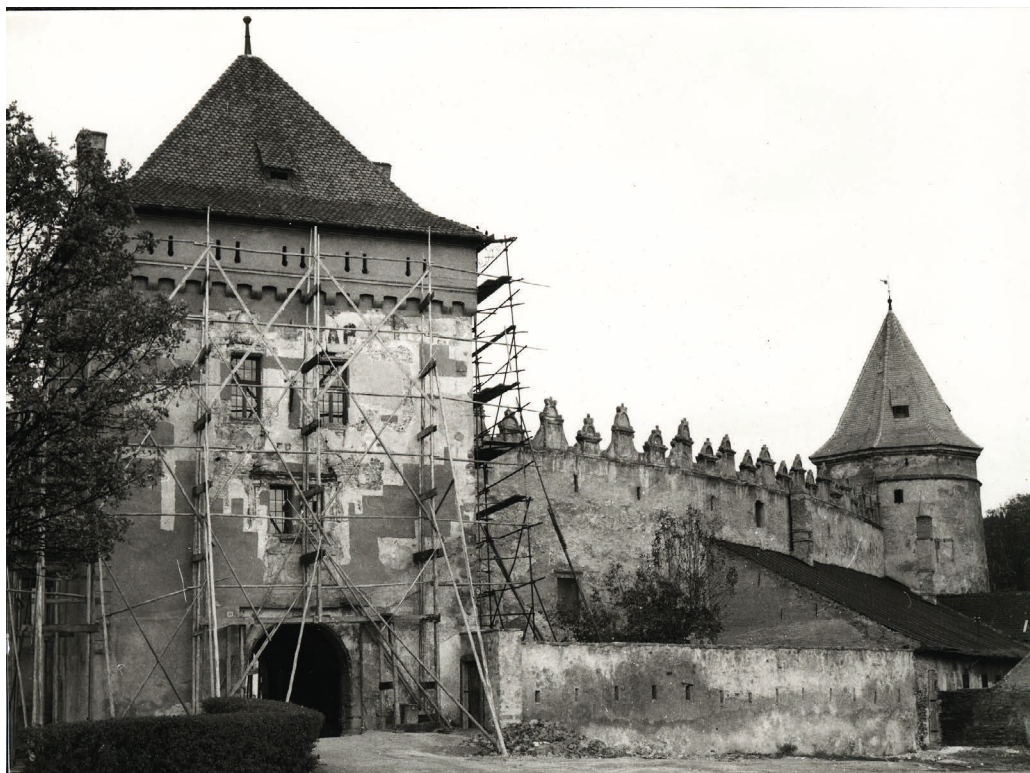
Fot. 7. Castle during reconstruction around 1975

museum's offices), storage space and library. During this period, the museum owned and managed a total of seven buildings (a wooden articular church, a lyceum, a castle, a bastion of the city fortification, two burgher houses and a poorhouse). Although the wooden articular church was in operation and the attendance was relatively high (there were 50,979 visitors in 1977), the pleas by the museum as well as by the city for the accelerated renovation were not answered. It regarded mainly the need to repair the roof which was considered an urgent matter.