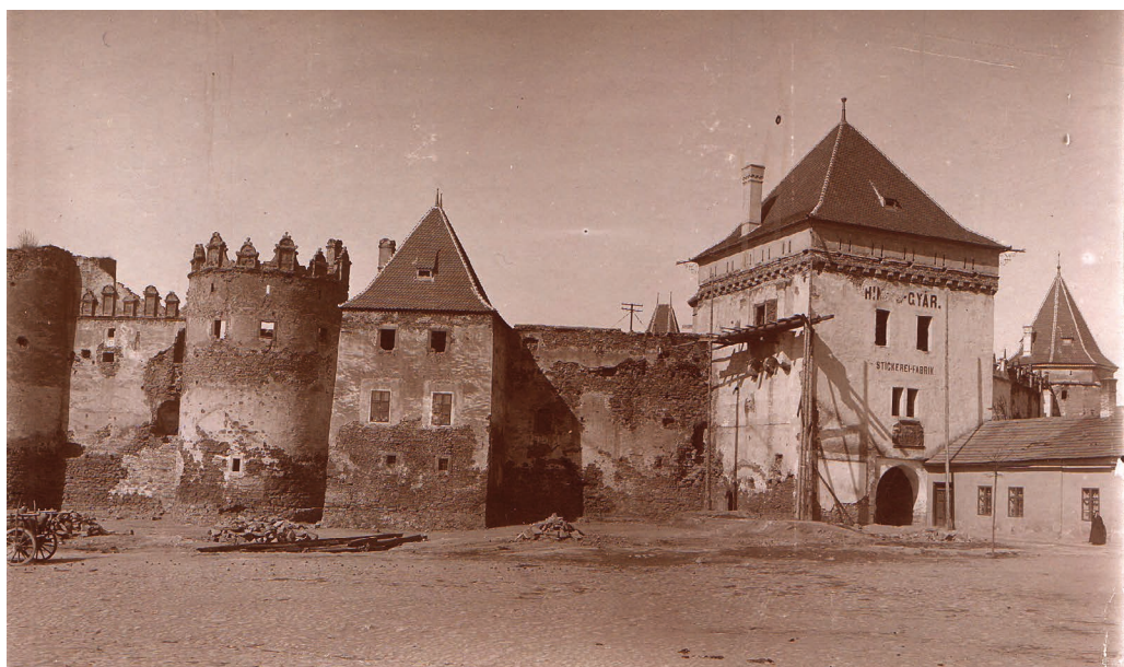
Fot. 1. Castle after a fire in 1901