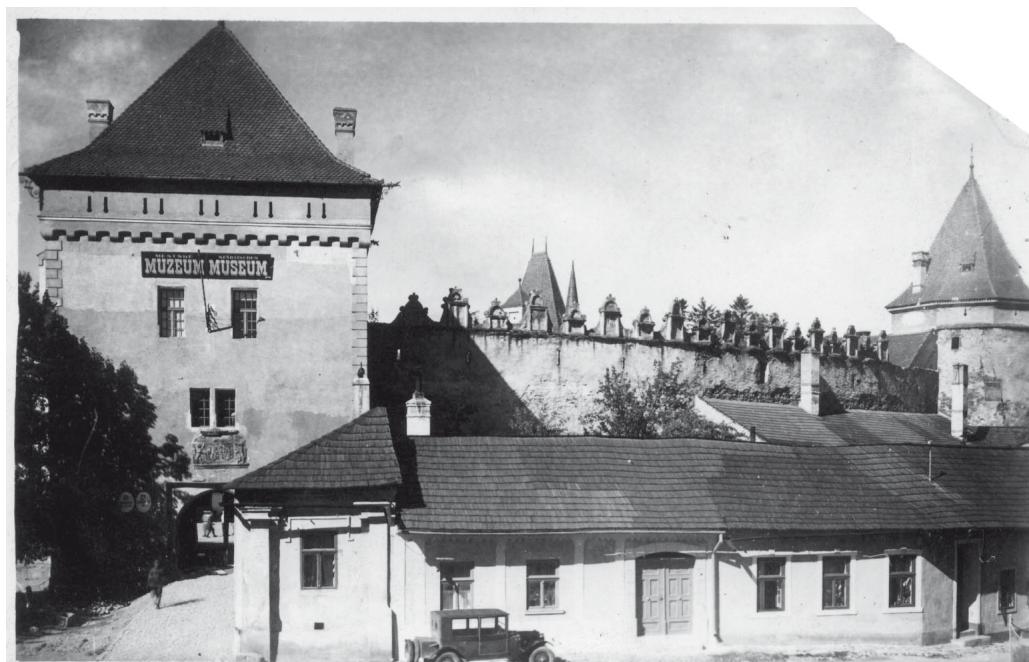
Fot. 2. Castle from 1931, when the museum was founded

and numerous works of art. All these objects were acquired by the museum mostly at no expense.