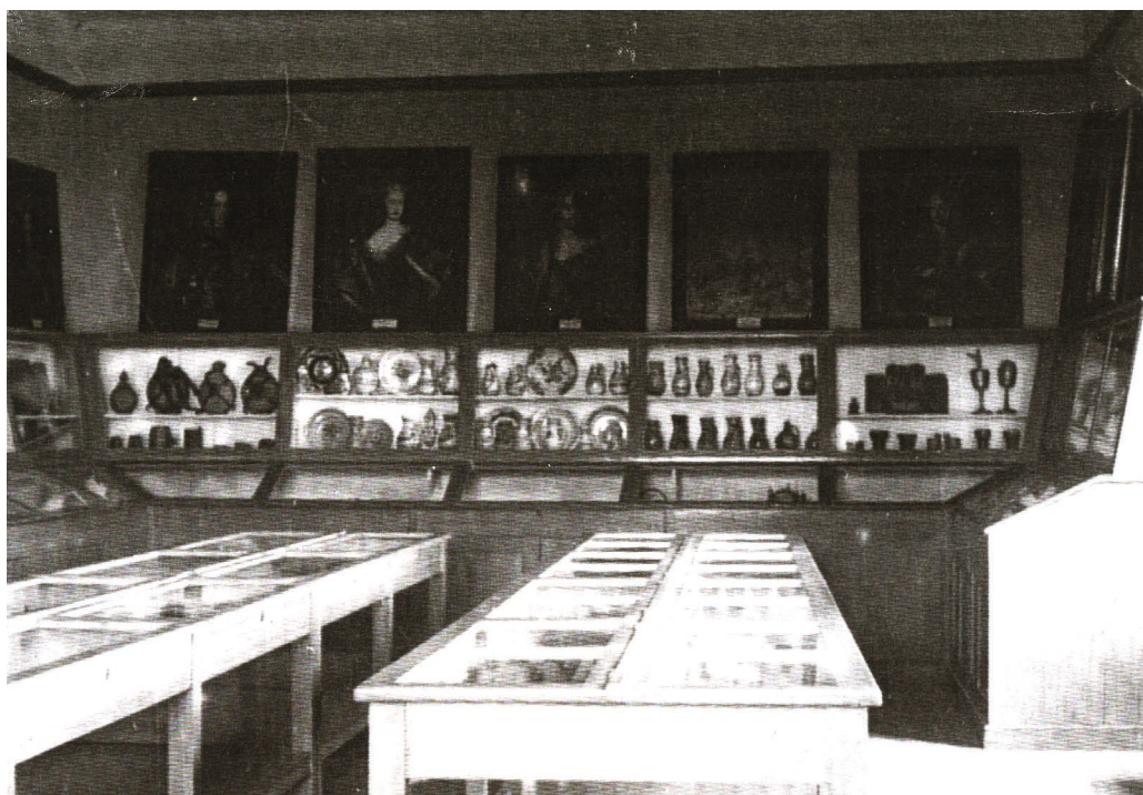
Fot. 4. First exhibitions in the castle