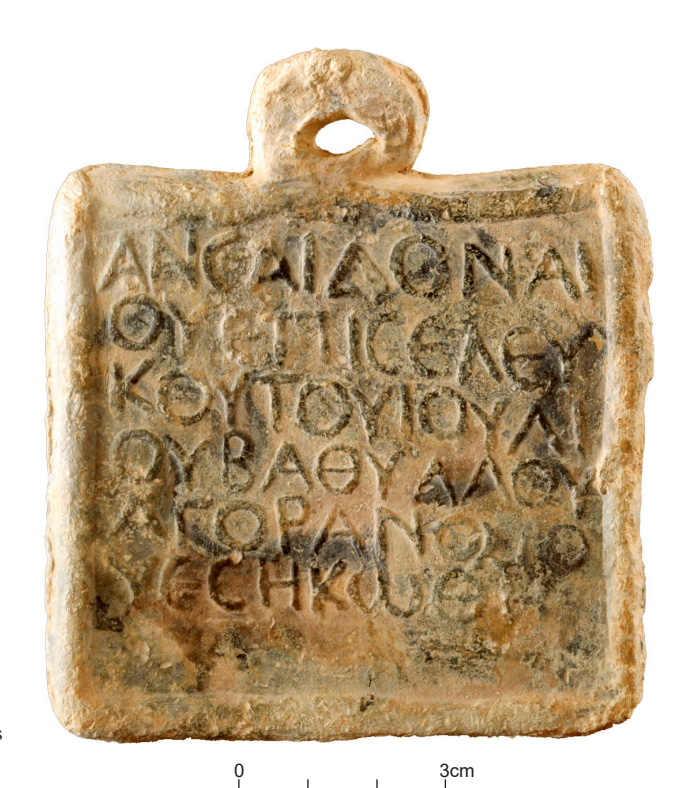
2. Weight of Seleucia in Pieria found in Nea Paphos (Phot. M. Iwan; © Paphos Agora Project; courtesy of the Paphos Agora Project).

The object was published by Alfred Twardecki who read the inscription as follows:<sup>3</sup>