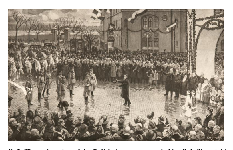
Il. 2. The welcoming of the Polish Army commanded by Col. Skrzyński, 18<sup>th</sup> of January, 1920. Painting by B. and F. Gęstwicki.