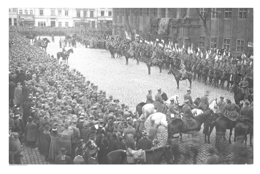
Il. 3. The welcoming of the Polish Army commanded by Col. Skrzyński, 18<sup>th</sup> of January, 1920.

army on the 18<sup>th</sup> of January does not include any gates II. 3)<sup>20</sup>. However, the picture from the 21<sup>st</sup> of January (showing the welcoming of Haller's troops) shows two (II. 4). Another one can be seen while looking at the photograph depicting soldiers marching along today's Queen Jadwiga Street (II. 5).