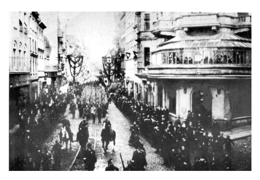
II. 5. The march of Polish Army along Elżbieta Street on the 21^{\rm st} of January, 1920.