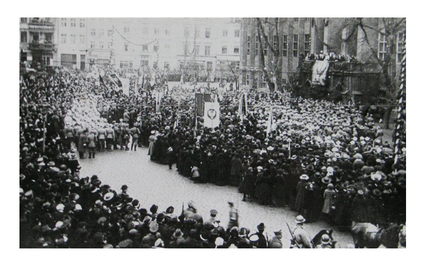
II. 4. The welcoming of Gen. Haller's in Toruń on the 21<sup>st</sup> of Januray, 1920.