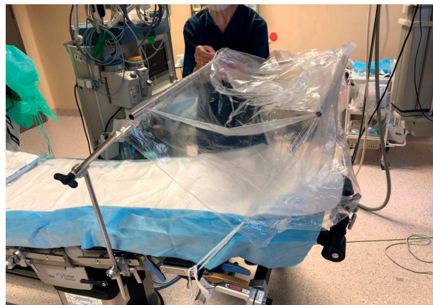
Figure 1. An aerosol box made of clear plastic drapes and screen frames used to separate the operation area from the anesthesiologist's area

makes intubation under the protective box easier, thus facilitating the management of potential difficulties during the intubation efforts.