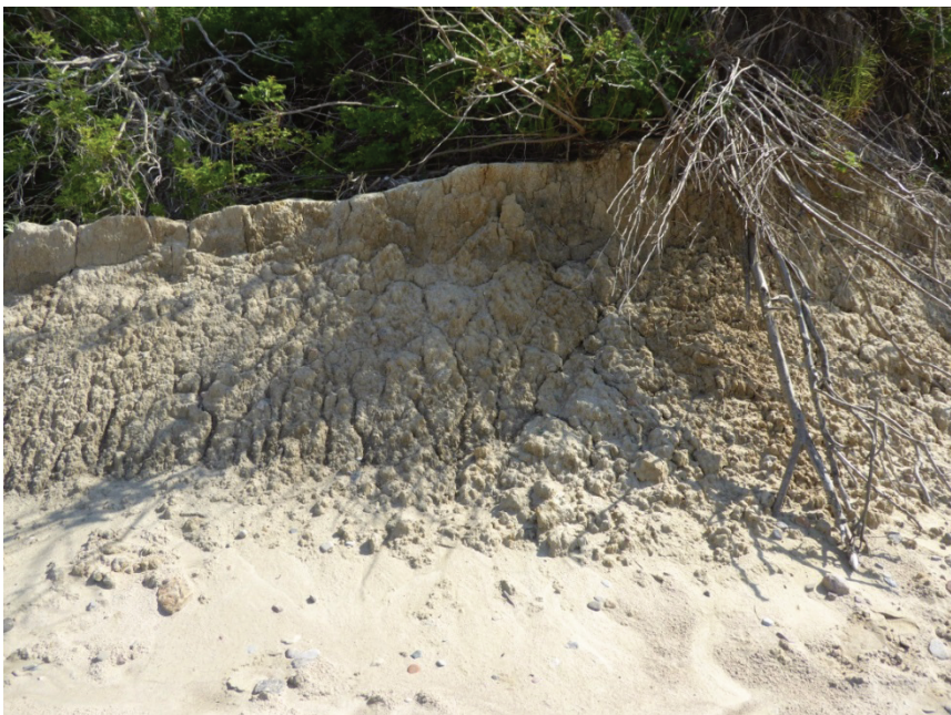
Fig. 6. Slope processes visible on the cliff.