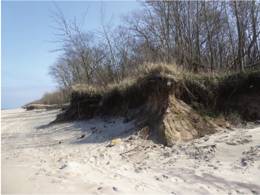
Fig. 5. Destruction of a Bagicz cliff.