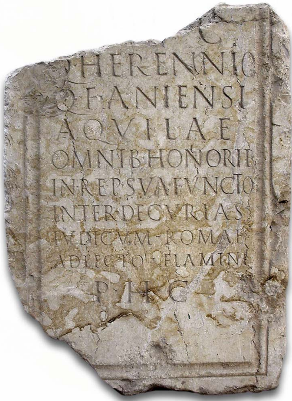
Fig. 6. Pedestal with omnibus honoribus in re publica sua functus form (CIL II 2 /14, 1143.)