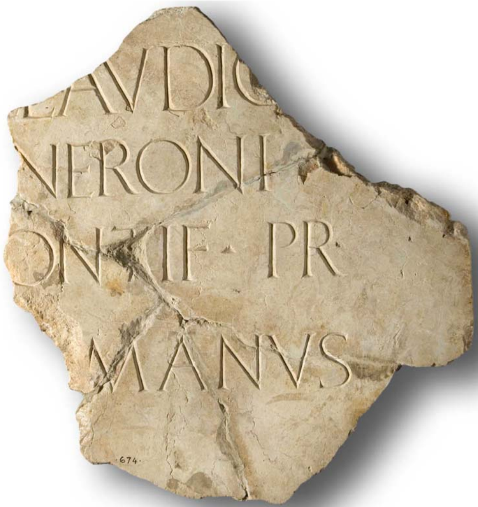
Fig. 7. Santa Tecla's marmor plaque of Tiberius (16-14 BC) (CIL II 2 /14, 879.)