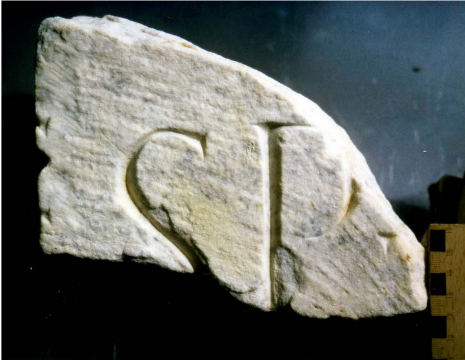
Fig. 2. Fragmentary Luni inscription with a part of the Vespasian's name (CIL II 2 /14, 895. Photo: BBAW-CIL)