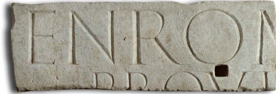
Fig. 4. Monumental Luni plaque with mention of a provincial flamen found in the amphitheatre (CIL II 2 /14, 1109. Photo: The National Archaeological Museum of Tarragona – MNAT)