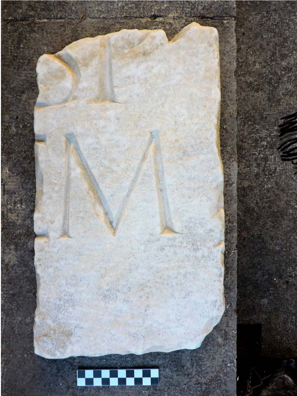
Fig. 3. Monumental Luni plaque with mention of an aedes found around the Augustus' temple (CIL II 2 /14, 899.)