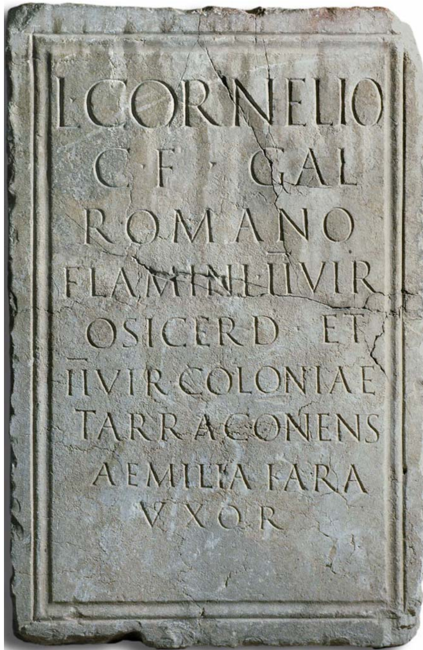
Fig. 5. Distinctive Tarraconense honorific tripartite pedestal (CIL II 2 /14, 685). The National Archaeological Museum of Tarragona – MNAT)