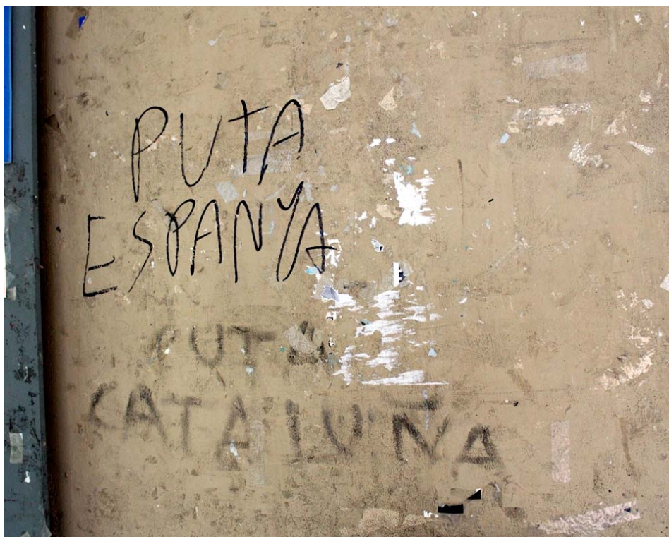
Fig. 19. These two inscriptions (both in Catalan) on a building wall respectively assert “Fuck Spain” and “Fuck Catalonia”.