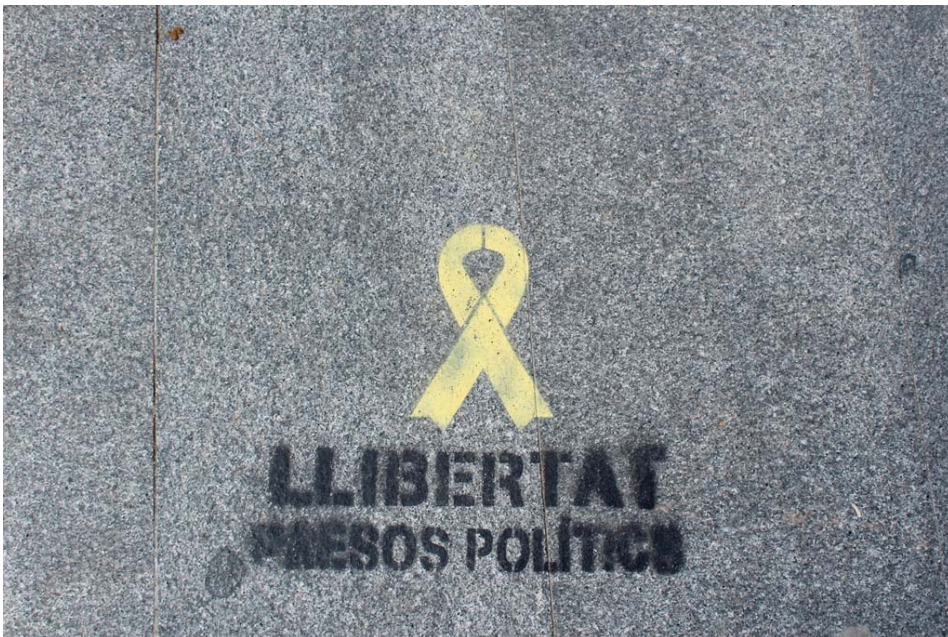
Fig. 16. Inscription on the sidewalk reading “Free political prisoners” complemented with a lazo amarillo .