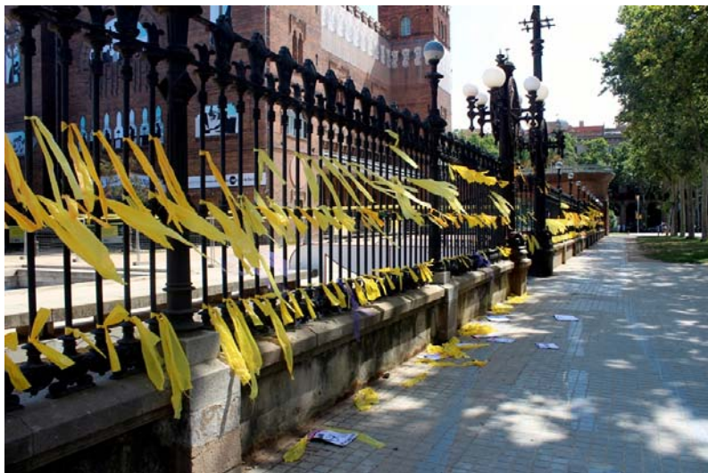
Fig. 8. Fence decorated with lazos amarillos .