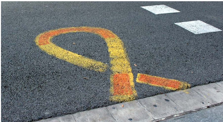
Fig. 10. Lazo amarillo changed into a lazo in Spanish colours.