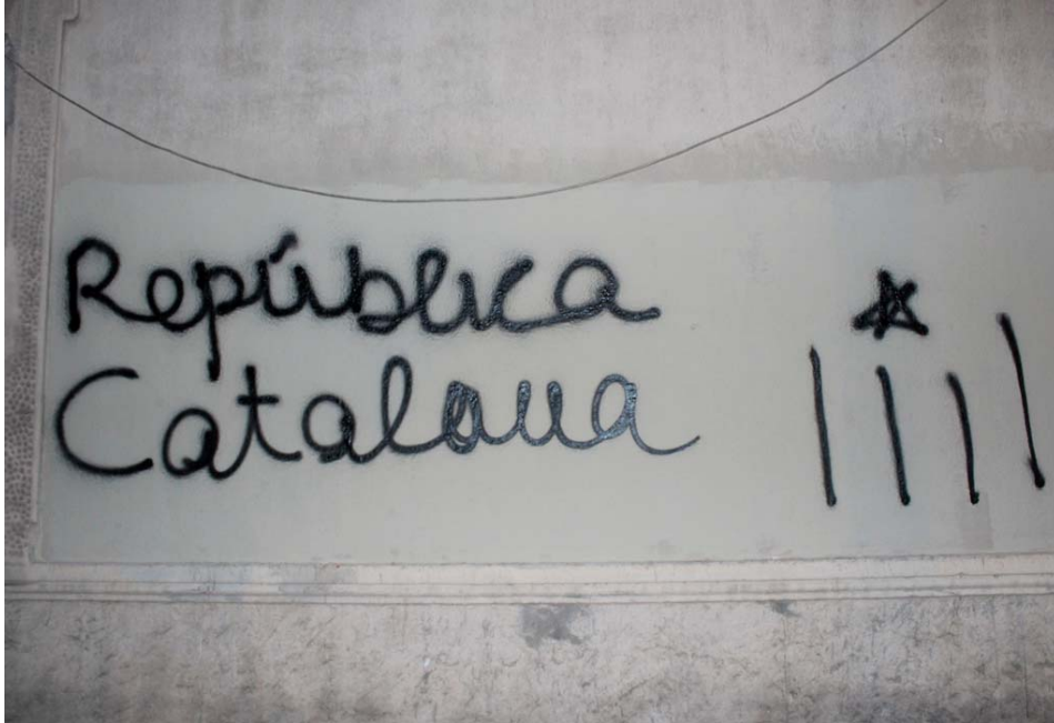
Fig. 11. A wall with the inscription reading “Catalan Republic” in Catalan and the estelada drawn next to it.