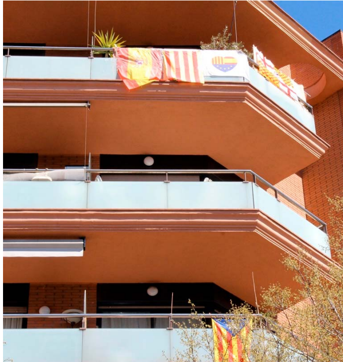
Fig. 6. Flag of Spain combined with the señera and the flag of the European Union.