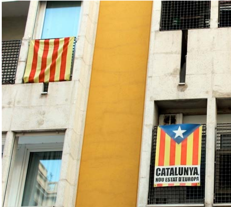
Fig. 7. Flag with a slogan in Catalan: “Catalonia, a new state in Europe”.