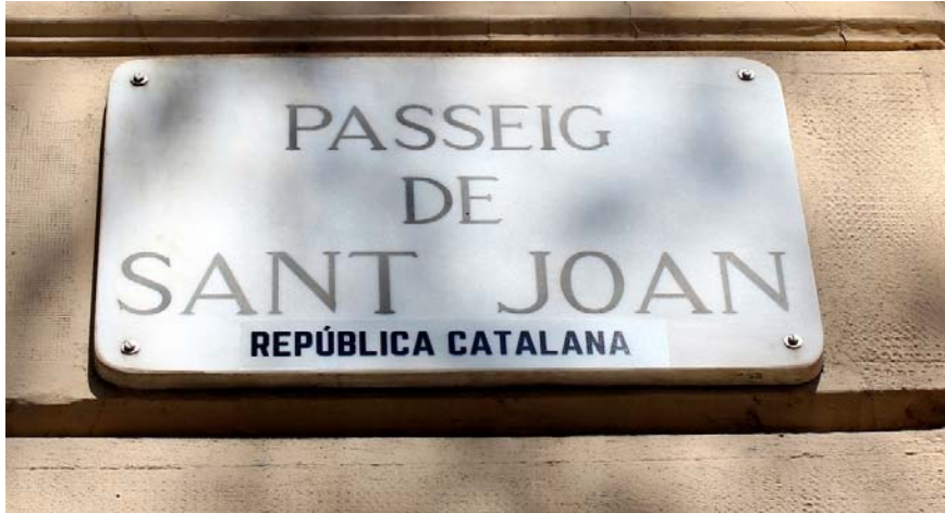
Fig. 2. Sticker with the slogan “Catalan Republic” (in Catalan) under a street name plate.