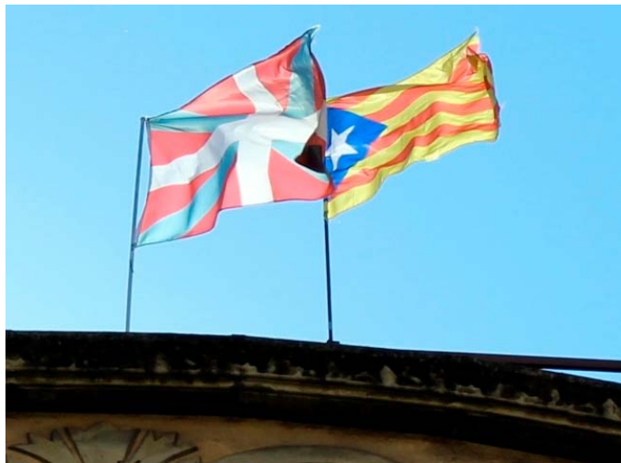
Fig. 5. The estelada accompanied by ikurriña .