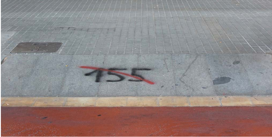
Fig. 15. The crossed-through figure of 155 protests the suspension of the autonomy of Catalonia under Article 155 of the Spanish Constitution.