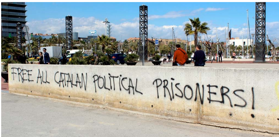
Fig. 12. The text in English, “Free all catalan political prisoners”, has been painted on a wall by the walkway to the beach.