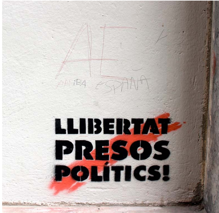
Fig. 17. The Catalan text on a wall, “Free political prisoners!”, has been countered with the slogan “Onward Spain”.