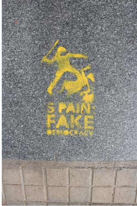
Fig. 13. The drawing on a sidewalk in the centre of Barcelona, showing a police officer beating a person, has been supplied with the message in English: “Spain: fake democracy”.