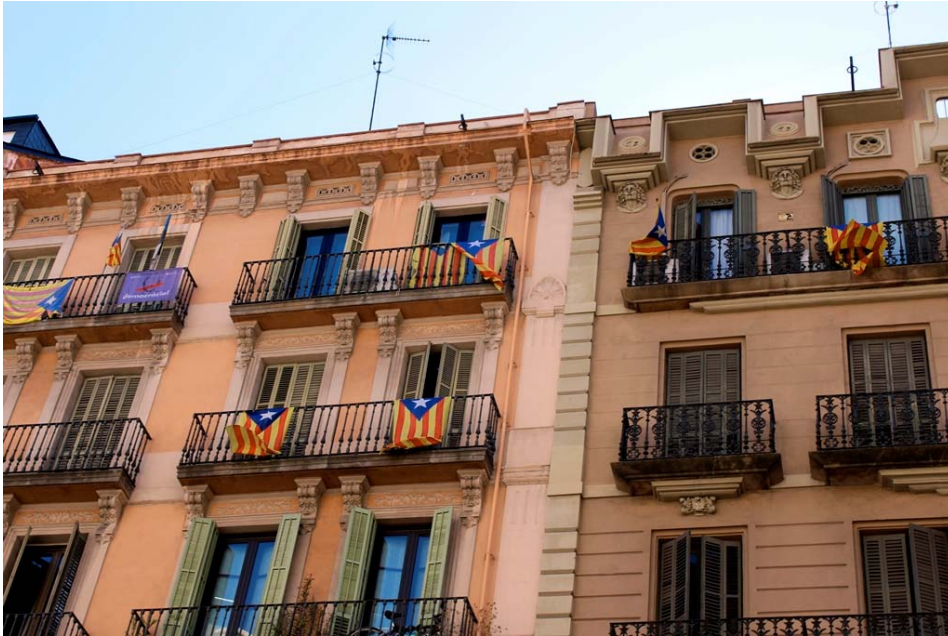
Fig. 4. A building dominated by esteladas .