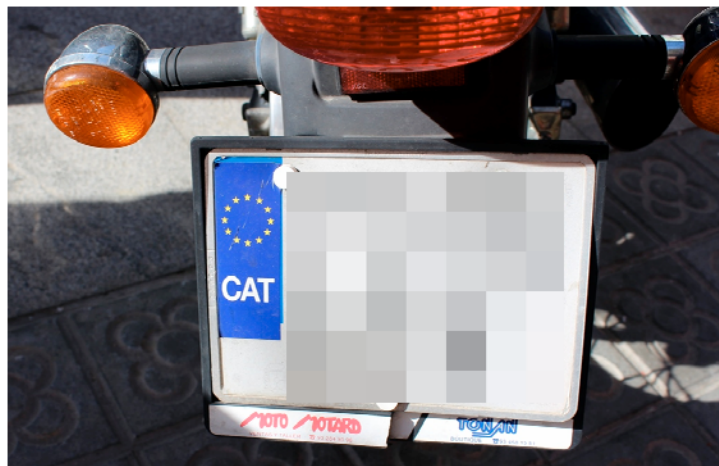
Fig. 18. The standard symbol for Spain on the licence plate of this scooter (E) has been replaced with a sticker saying CAT (for Catalonia) and matching EU iconography.