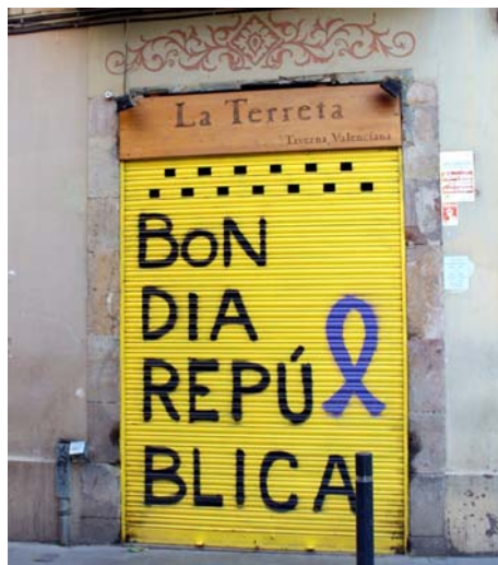
Fig. 14. “Bon dia República” ( Good Morning Republic ) with a lazo, painted on outer doors.