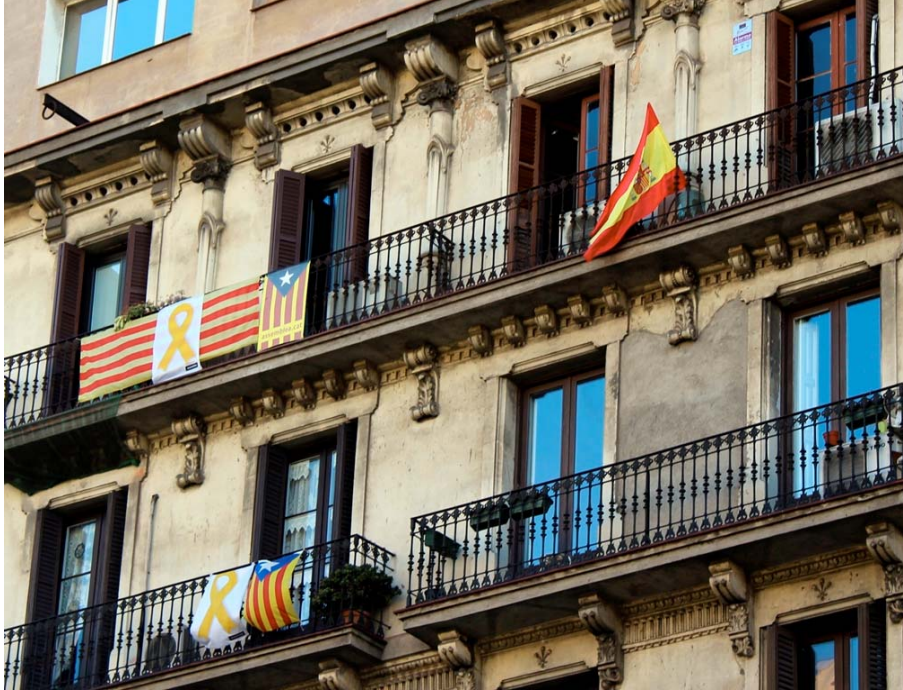
Fig. 9. Building on which the señera , the estelada , a lazo amarillo and the rojigualda can be seen together.