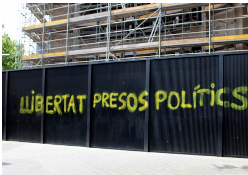
Fig. 1. “Free political prisoners” in Catalan in one of the main streets of Barcelona. All photographs made in Barcelona by Filip Kubiaczyk.

known as señera and the national Spanish rojigualda . Slogans such as “Away with the monarchy!”, “Catalan Republic” or “Fuck Spain!” clash with “Long live the king!”, “Long live Spain!” and “Screw Catalonia!”. Contrary to widely held opinions, the author argues that the struggle for freedom and free speech in Catalonia after October 1 st , 2017 – excluding evident instances of violation of such rights – attest to the polysemous nature of the Catalan community in what is the most severe political crisis that the Iberian Peninsula has experienced in the 21 st century.