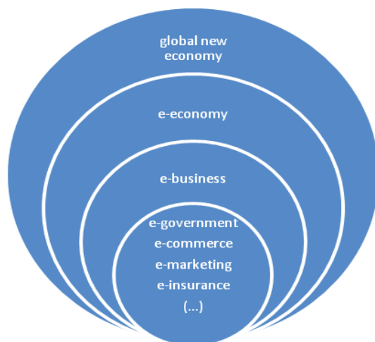
Figure 1. The divisions within the new economy

not only a choice, but a necessity. There is a new quality in the economy, based on increasing development of new technologies. According to experts, they need to be standardized and harmonized across the world (Papińska-Kacperek, 2008, pp. 409-410). To remain competitive in the world market, all countries need to take care of the development of the information society structures. Countries within the EU have to accept a number of provisions related to the development of the information society. A very important element here is e-government (Doktorowicz, 2005, p. 159). Figure 1 presents the division within the new economy, and the position of e-government.