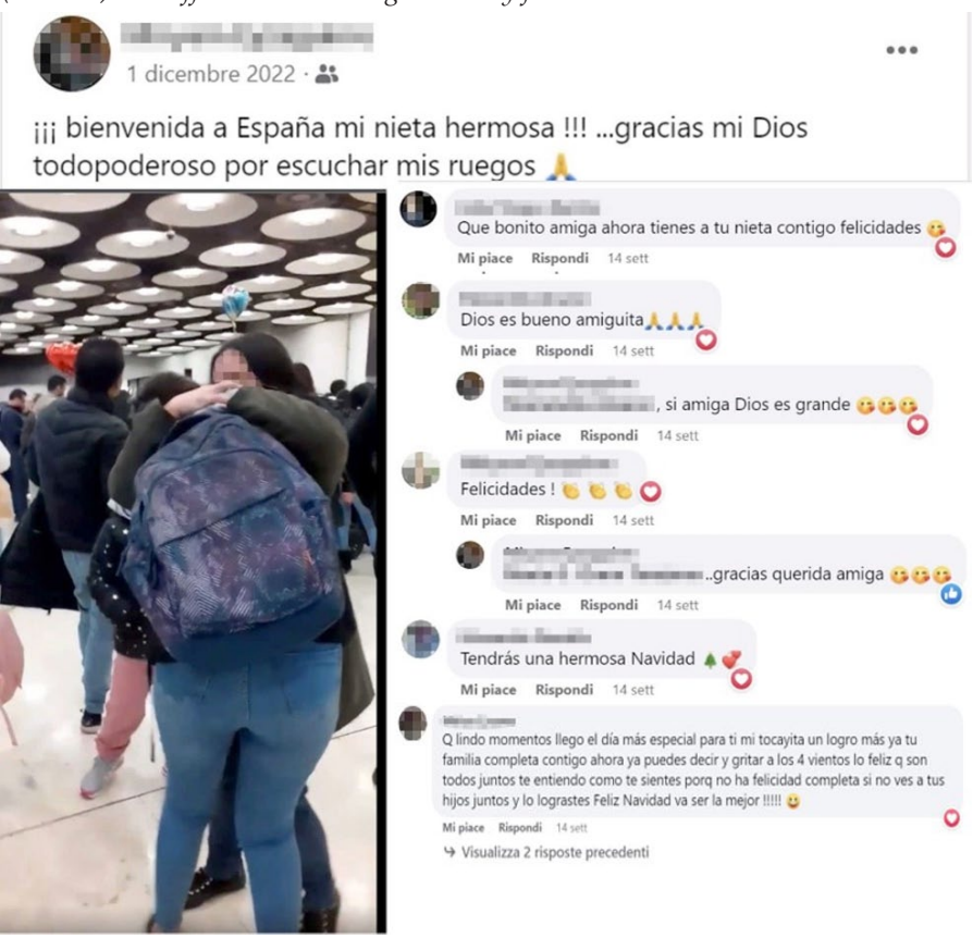
Figure 1 Facebook post of P5, video of his granddaughter's arrival at Adolfo Suárez airport (Madrid) and affectionate messages sent by friends.

Note. Extracted from Facebook. Source. Own research.