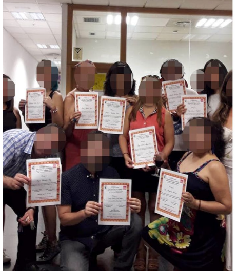
Figure 3 Presentation of certificates in sonority and inclusive feminism.

In this regard, below is a very significant image of an act held by the association to which informant P7 refers, which shows the presentation of a certificate for having completed a course on sonority and feminism: