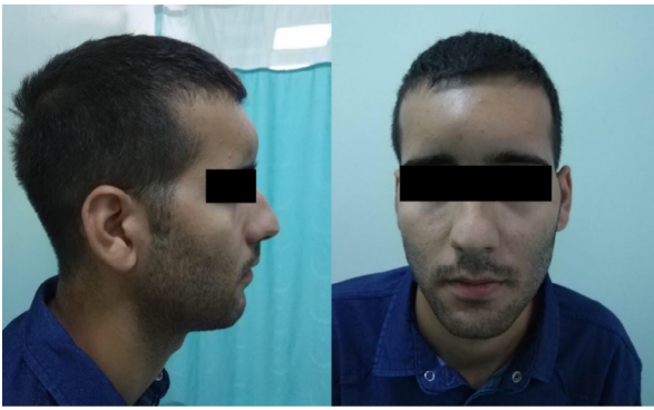
Fig. 1. An 8 cm x 8 cm fluctuant, tender, warm swelling over the forehead

tests were all within the normal range. Pott's puffy tumor was explained as a rare complication of current