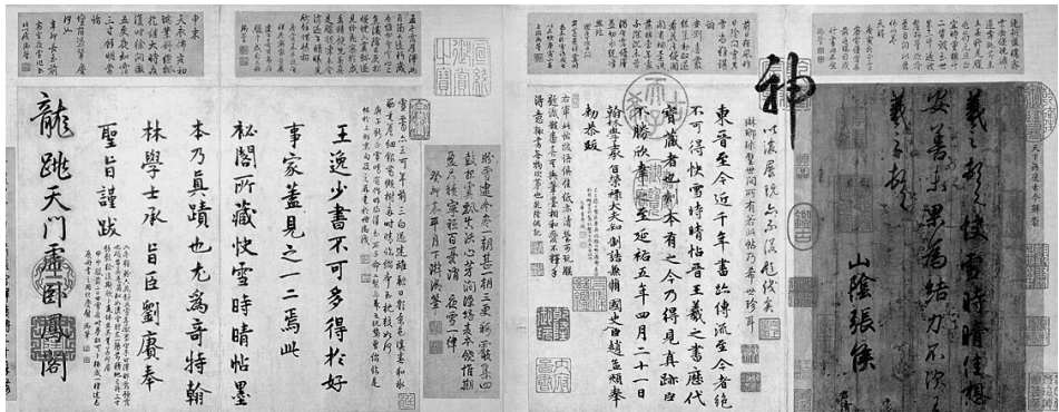
Fig. 6. A detail of calligraphic model 快雪時晴帖 Kuai xue shi qing tie (Clear Day After Sudden Snow) Wang Xizhi 王羲之 (321–379), Palace Museum in Taipei