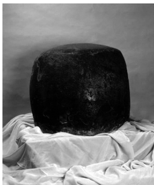
Fig. 3. The granite drum with inscriptions (770–221 BC (?))