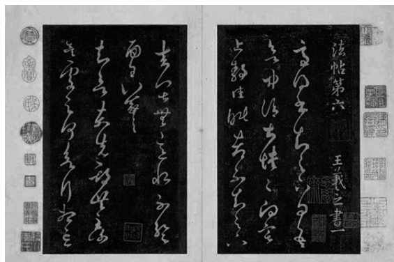
Fig. 1. Chun hua ge tie 淳化閣帖, the oldest anthology of stone inscriptions published on the order of the Emperor Taizong in 992, The North Song Dynasty (960–1127), Shanghai Museum