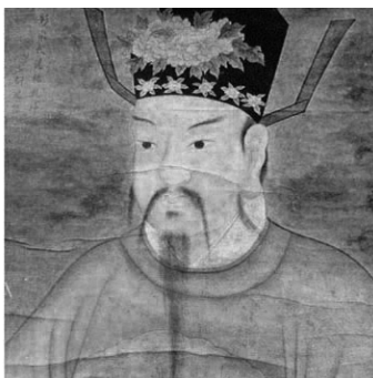
Fig. 2. Portrait of Ouyang Xiu 欧阳修 (1007–72)