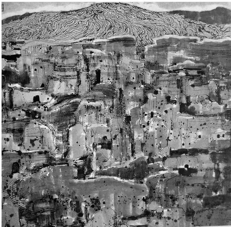
Fig. 9. Wu Guanzhong, The Ruins in Gaochang , ink painting, 101×105 cm, 1981