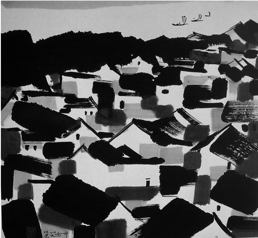
Fig. 6. Wu Guanzhong, Water Village , ink painting, 44×48 cm, 1997