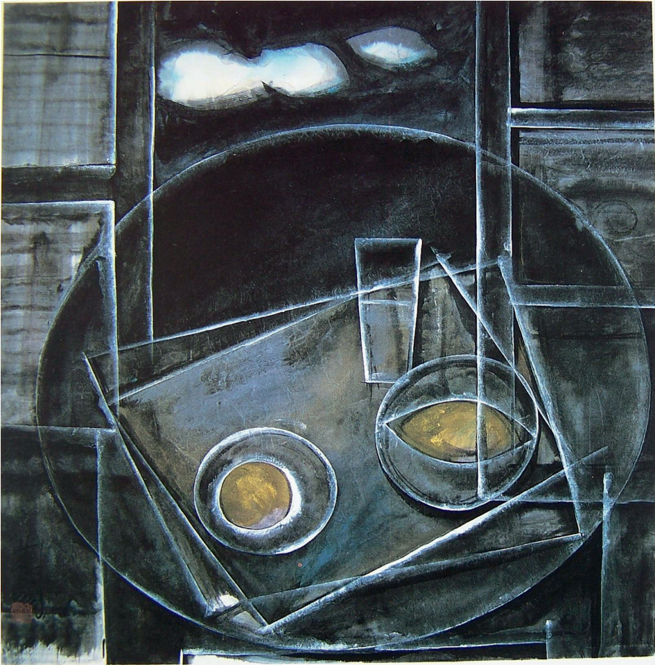
Fig. 2. Lin Fengmian, Ten Years Study , ink painting, 68×68 cm, c. 1950s