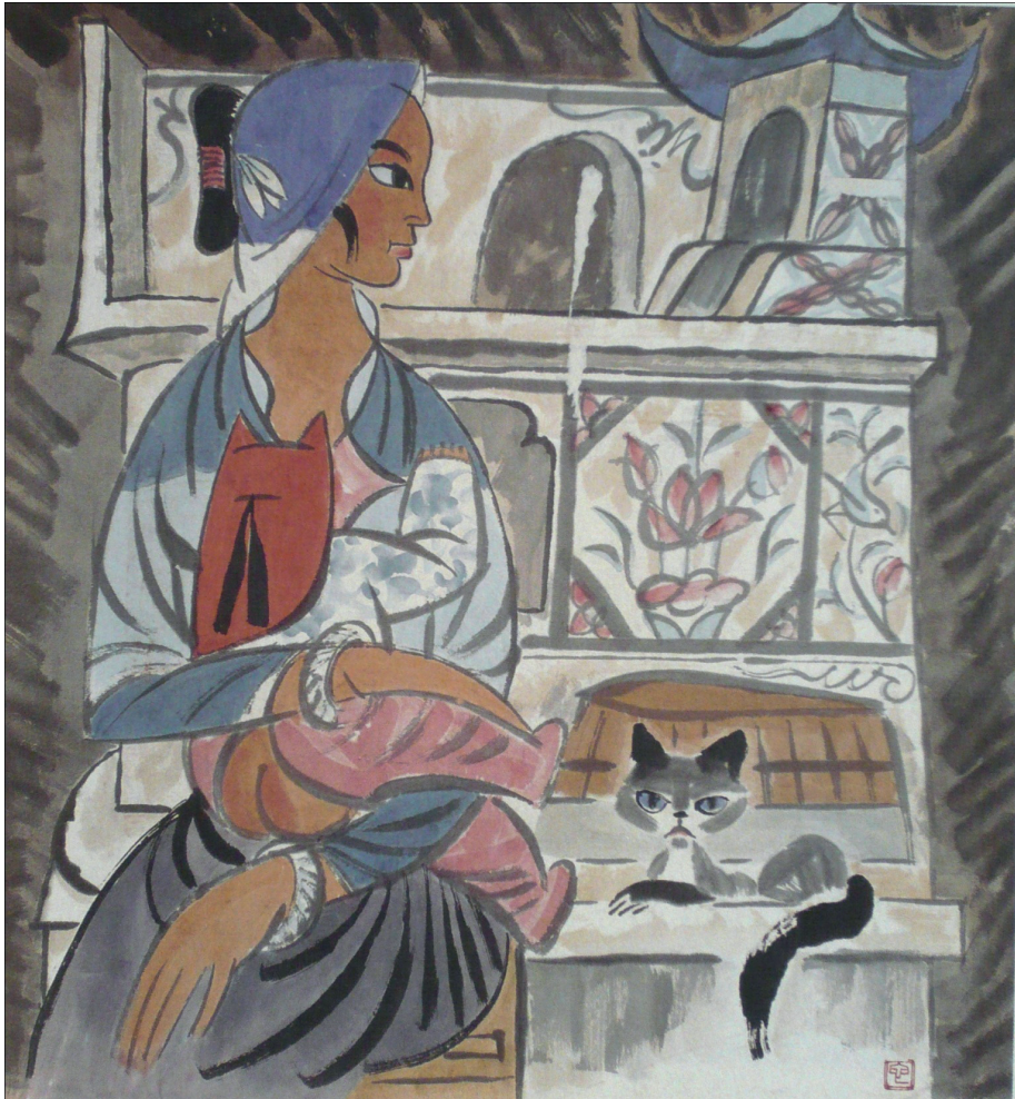
Fig. 4. Zhang Ding Stove , ink painting, 70×70 cm 1960s