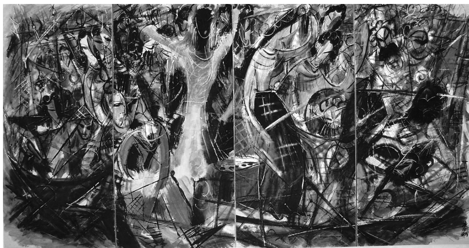
Fig. 3. Lin Fengmian Shui Man Jin Shan , ink color painting, 121×27cm, c. 1950