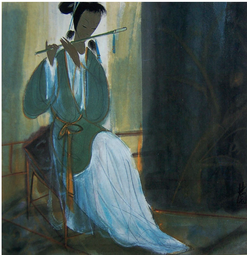
Fig. 1. Lin Fengmian, Flute Lady , ink color painting, 33×33 cm. c. 1940s