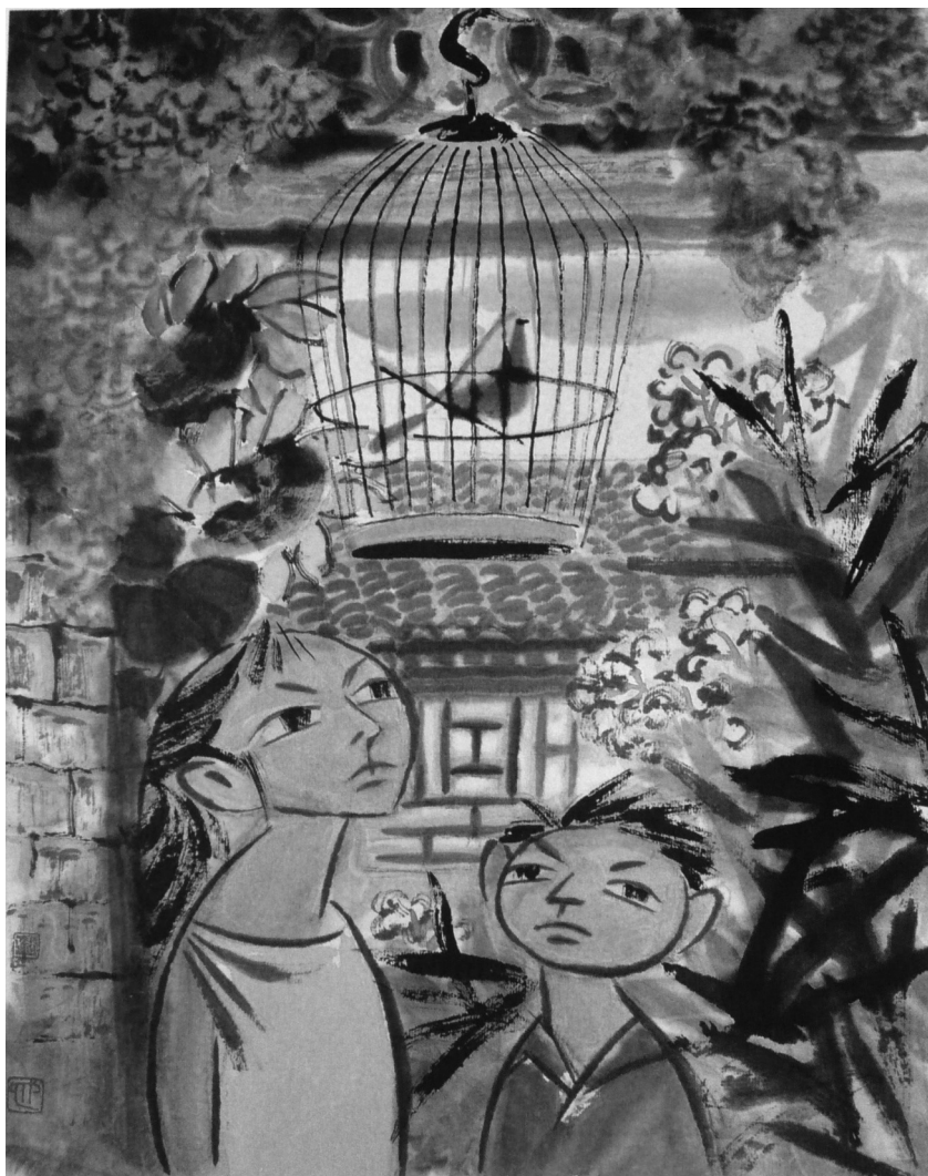
Fig. 5. Zhang Ding, Listening , ink painting, 46×35 cm, 1960s