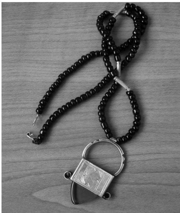
Fig. 6. Tenfuk – silver, red glass, Niger, 21 st century, private collection