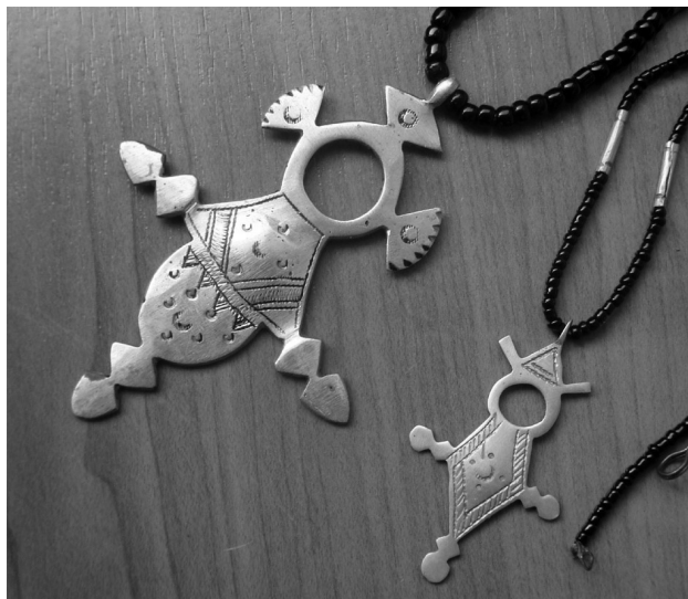
Fig. 9. Agadez Crosses – silver, Mali and Algeria, 21 st century, private collection