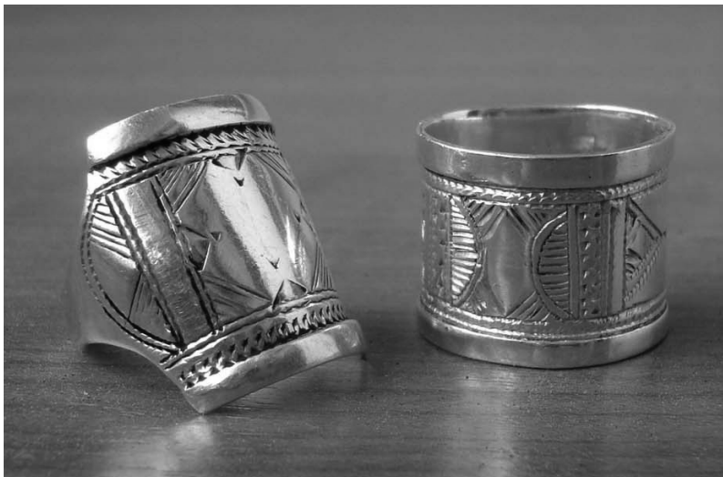
Fig. 8. Finger rings – silver, Niger, 21 st century, private collection