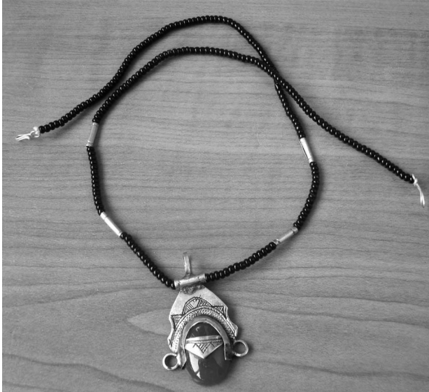
Fig. 3. Kabohon – silver, carnelian stone, Niger, 21 st century, private collection