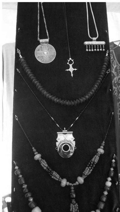
Fig. 10. Tuareg and Berber necklaces on an African market in Berlin in 2012