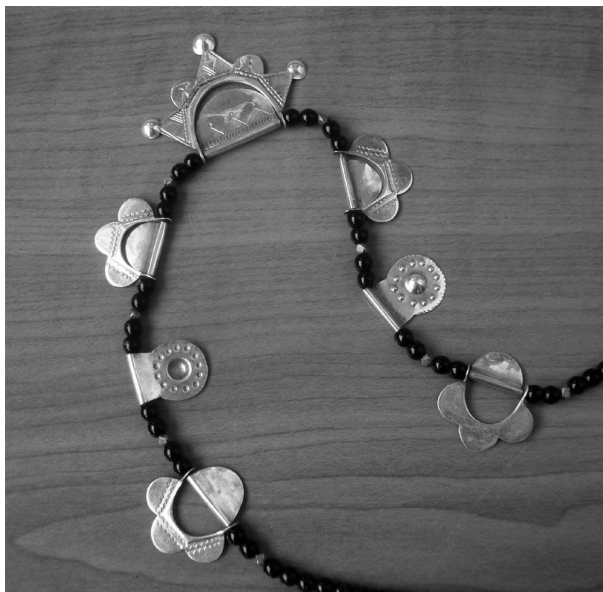
Fig. 5. Shashat – silver, Niger, 21 st century, private collection