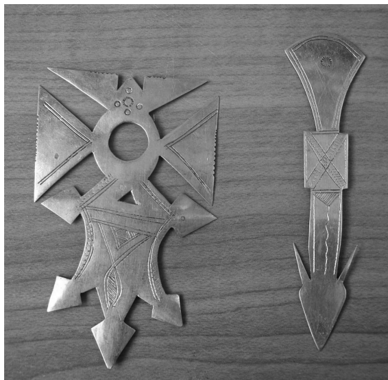
Fig. 1. Cross shaped jewelry, white metal, Bilma and Zinder, 21 st century, private collection