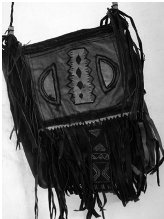
Fig. 2. Bag made of goat skin, Algeria, 21 st century, private collection