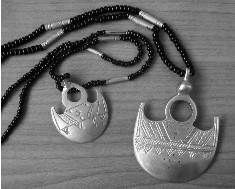
Fig. 7. Timia – silver, Mali, 21 st century, private collection