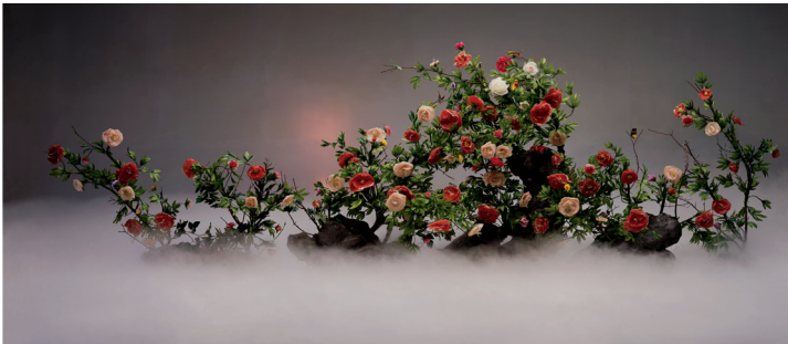
Ill. 5. Wang Qingsong, "Ethereal Beauty", 120x280 cm, 2003.