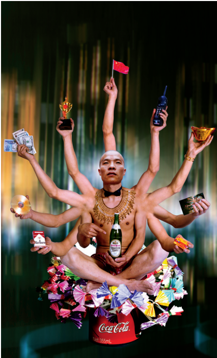
Ill. 4. Wang Qingsong, "Requesting Buddha" series no. 1, 180x110 cm, 1999.