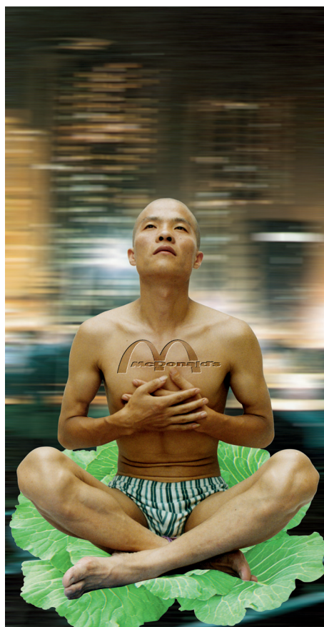
Ill. 3. Wang Qingsong, "Thinker", 180x90 cm, 1998.