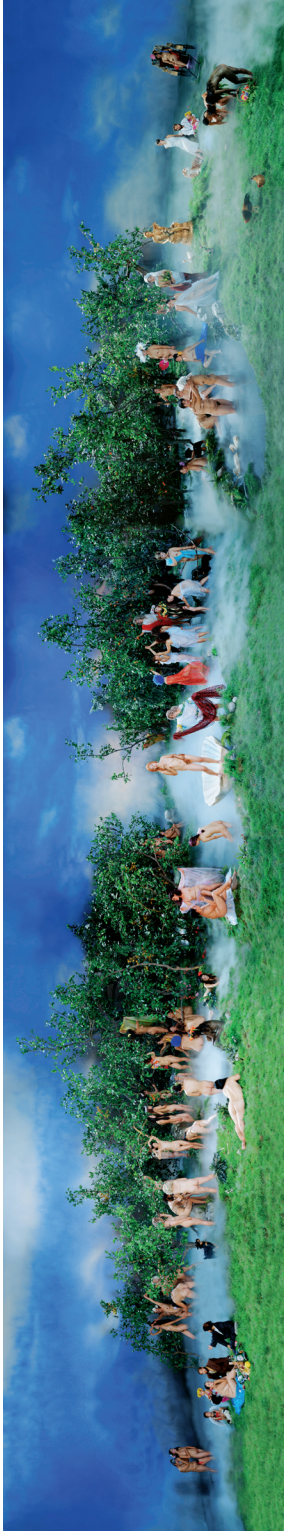
III. 8. Wang Qingsong, "Romantique", 120x650 cm, 2003.