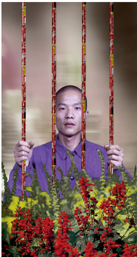
Ill. 2. Wang Qingsong, "Prisoner", 180x95 cm, 1998.