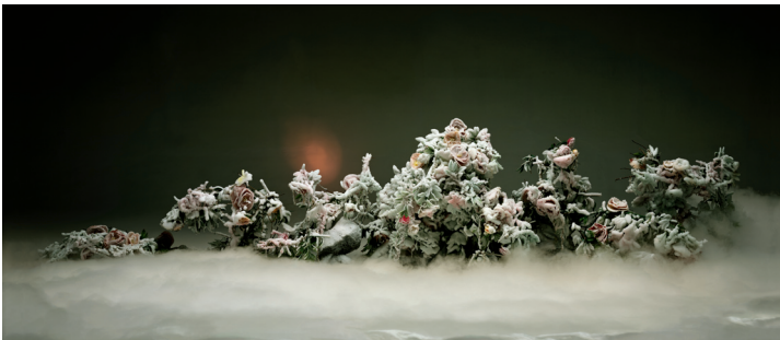
Ill. 6. Wang Qingsong, "Auspicious Snow", 120x280 cm, 2003.