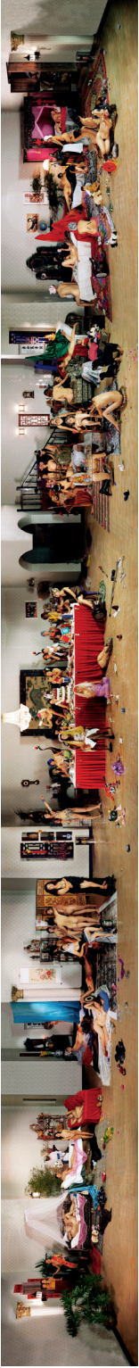
III. 7. Wang Qingsong, "China Mansion", 120x1200 cm, 2003.