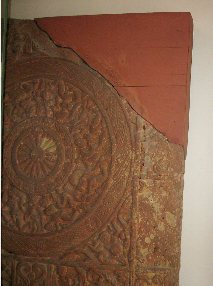
Fig. 1. A Symbol āyāgapaṭa donated by Mātharaka depicting a dharmacakra in the centre; Kankali Tila, 1 st Century BCE, State Museum, Lucknow