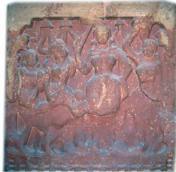
Fig. 4. Figural āyagaṇa donated by Amohinī depicting a Jain goddess; Kankali Tila, 1 st century CE, State Museum, Lucknow