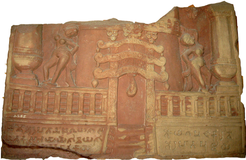
Fig. 3. Stūpa āyāgaṇa donated by Śivayaśā showing a broken Jain stūpa; From Kankali Tila, 1 st century BCE, State Museum, Lucknow