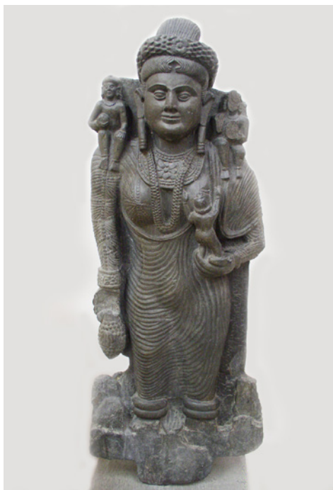
6. Hariti, 2nd CE, Skarah Dheri, Government Museum and Art Gallery, Chandigarh, No. 1625, photo: © A. Staszczyk.