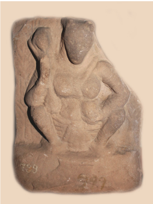
8. Matrika Panel, 2nd-3rd CE, Mathura, Government Museum Mathura, No. 799, photo: © A. Staszczuk.