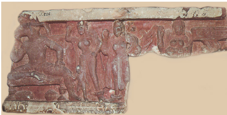
2. Worshipping Naigamesha, 2nd–3rd CE, Mathura, State Museum Lucknow, No. J.626 / 528, photo: © A. Staszczyk.