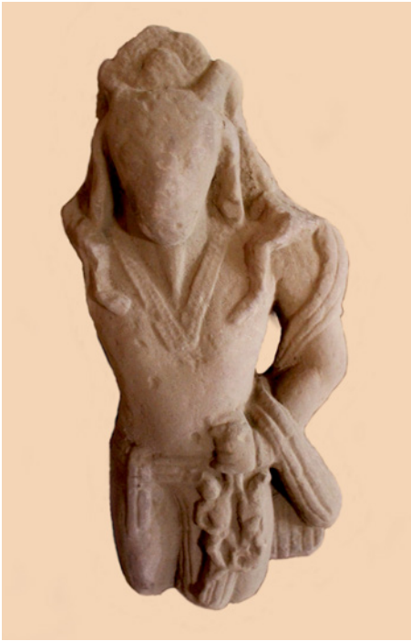
3. Naigamesha with Children, 2nd–3rd CE, Mathura, Government Museum Mathura, No. E.1