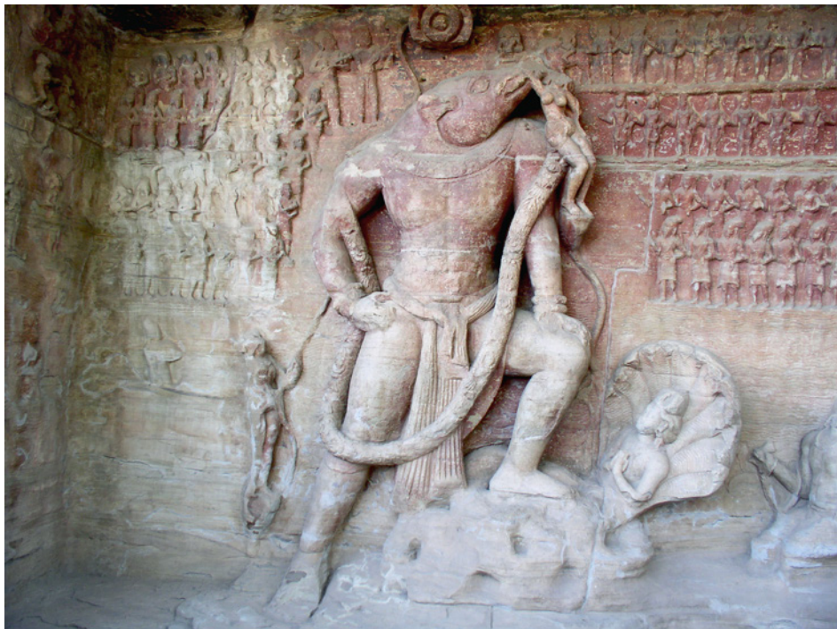
1. Varaha Cave, Udayagiri, 401 CE (in situ), photo: © A. Staszczyk.