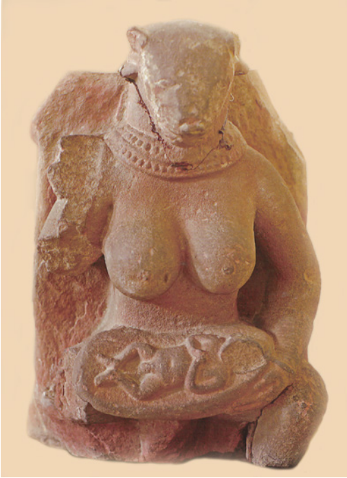
7. Female Goat-headed Deity, 2nd-3rd CE, Mathura, Government Museum Mathura, No. E.2