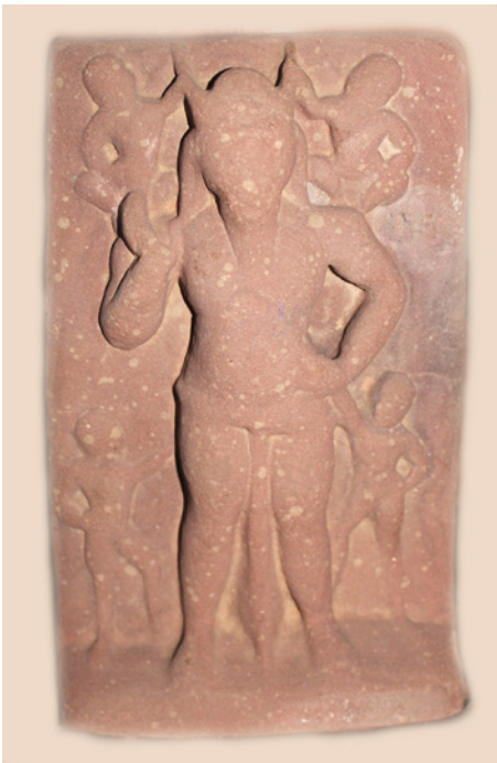
4. Naigamesha, 2nd–3rd CE, Mathura, Government Museum Mathura, No. 1115, photo: © A. Staszczyk.