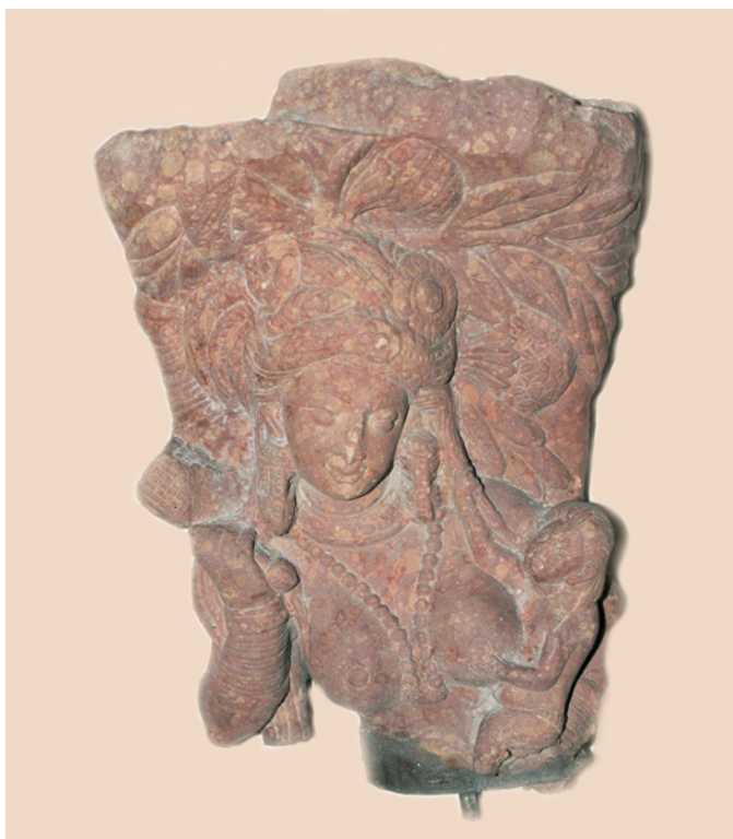
10. Motherhood or Abundance Deity, 2nd-3rd CE, Mathura, Government Museum Mathura, No. F.16, photo: © A. Staszczyk.