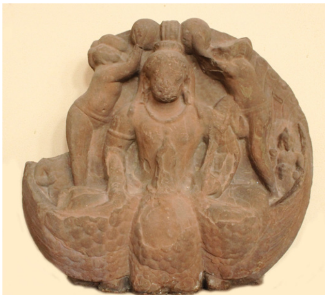
9. Skanda's Abhisheka, 4th-5th CE, Government Museum Mathura, No. 466, photo: © A. Staszczyk.